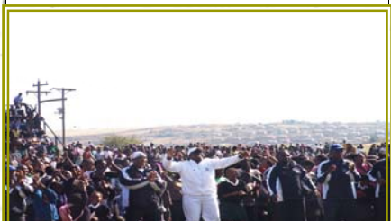
The youth of Richmond showed up in large numbers to this event