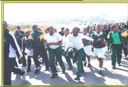
School children from Richmond surrounding schools fully participating in the Abstinence Walk