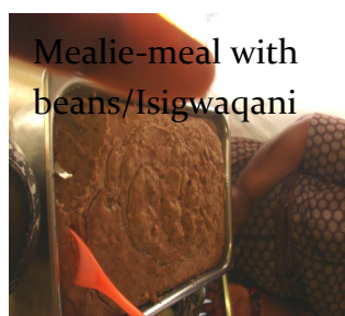
Mealie-meal with beans/Isigwaqani