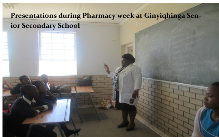
Presentations during Pharmacy week at Ginyiqhinga Senior Secondary School

Rietvlei Hospital Pharmacy team informed their audience about pharmacy as a profession. They also highlighted the admission criteria for prospective Pharmacy students, as well as bursaries available in KwaZulu-Natal Department of Health. They indicated benefits of being a Pharmacist as a scarce skill. There were educational talks on antibiotic resistance which focused on different topics such as how to take antibiotic, what is an antibiotic resistance as well as how to prevent antibiotic resistance. There were prizes and refreshments in both occasions.