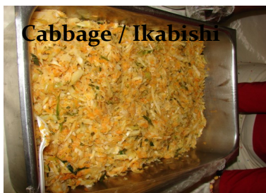
Cabbage / Ikabishi