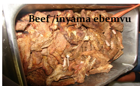
Beef /inyama ebemvu