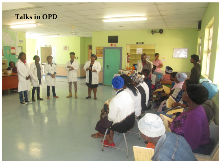
Talks in OPD