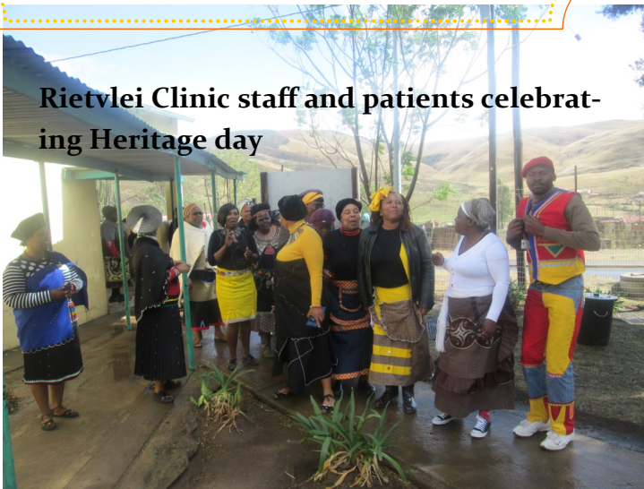
Rietvlei Clinic staff and patients celebrating Heritage day