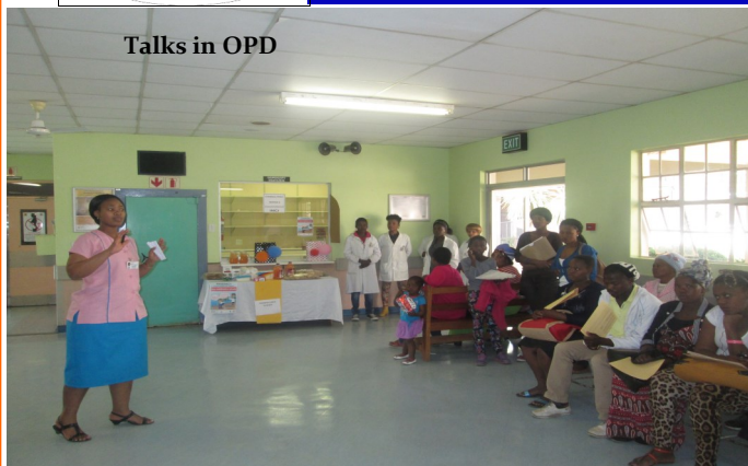
Talks in OPD

On 01 September 2014 to 08 September 2014 is pharmacy week. The theme for this year was on rationale use of medicines and microbial resistance (AMR). “Use antibiotics wisely!!”