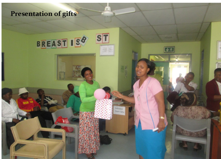
Presentation of gifts