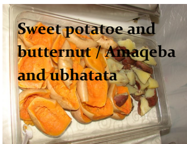
Sweet potatoe and butternut / Amaqeba and ubhatata