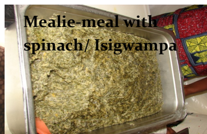
Mealie-meal with spinach/ Isigwampa