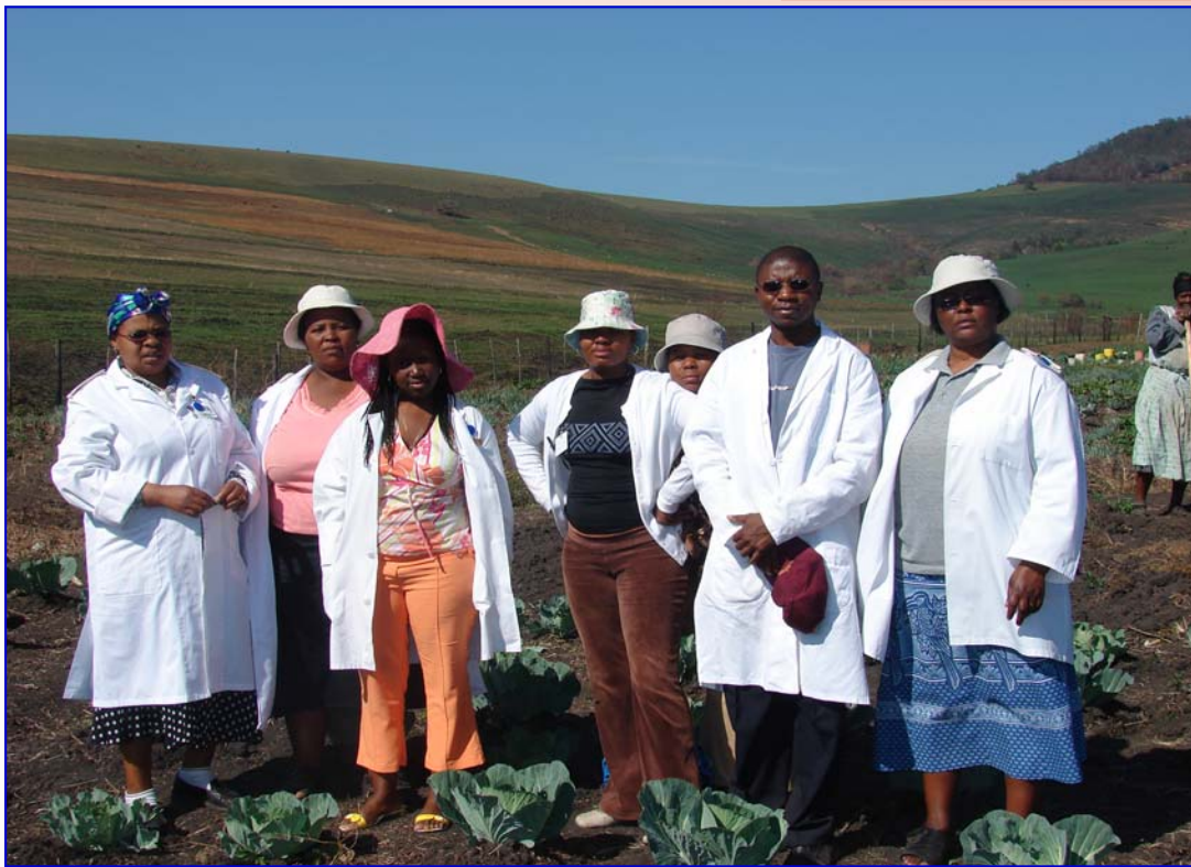
THIS IS A GROUP OF 2ND YEAR STUDENTS.