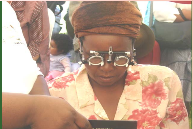
Esithombeni ngenhla: Omunye oweyezohlolwa amehlo

iRietvlei Hospital ibeno mgidi wamehlo ngomhlaka 11 ku December 2007 endaweni yaseRauka. Isibhedlela besibambisene ne Sisonke District ekufezekiseni lomgidi, lapho ebekuhona amakhosi endawo kanye nomphakathi wonkana uzozizwela wona mayelana nenkinga yamehlo. Bekuhlolwa amehlo kuphinde kumukeliswa nezibuko zawo amehlo, kanti abanye bathole izintonga zokuhamba nezinye izipho. Izintombi nezinsizwa ezindala zabe futhi sezithola nokufundiseka ngawo amehlo nokuqala kokugula, nokuhlolwa kwawo. Kithina kwaba yisenzo esibalulekile ukuthi siyise izidingo zomphathi kubo.