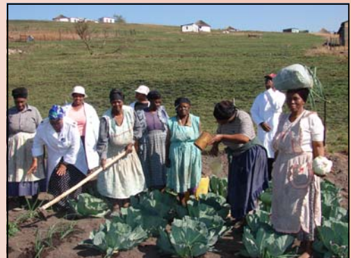
Lapha zazibuya egadini