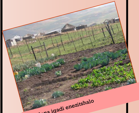
Yiyo lena igadi enezitshalo