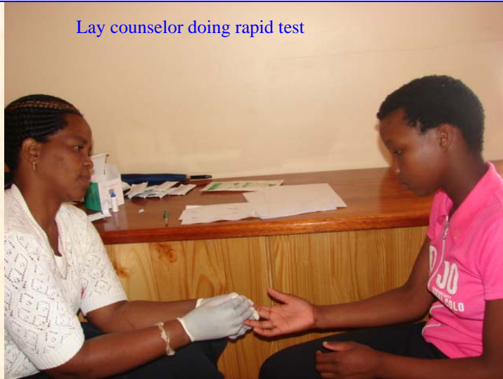
Lay counselor doing rapid test

On 06 December 2012 Umzimkulu municipality hosted it's local Aids day. On this day different health services were offered to the community of Umzimkulu. Matron Sosibo on her speech highlighted the importance of testing for HIV and Aids. She also encouraged youth to use their local clinics for any health related issues. She revealed that HIV / Aids statistics indicates that most people are now testing for HIV and are starting treatment on time. There is a decrease in number of patients infected with HIV and TB.