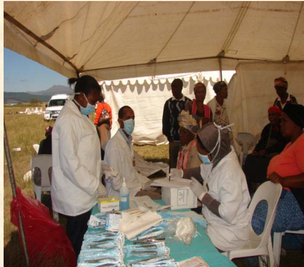
Dental clinic staff assisting patients