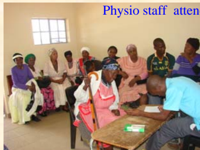
Physio staff attending to patients