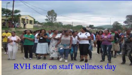
RVH staff on staff wellness day

Rietvlei District Hospital in Umzimkulu in Southern KwaZulu-Natal, hosted a successful ‘ STAFF WELLNESS DAY ’ event on the 30 th / November / 2011 just on the eve of the Worlds Aids Day commemoration. The day started with an energizing walk by staff from the hospital’s main entrance at 08h30, down the road to the location, past the taxi rank, up the main road and back to the hospital where everybody gathered at the hospital hall for the start of the day’s programme.