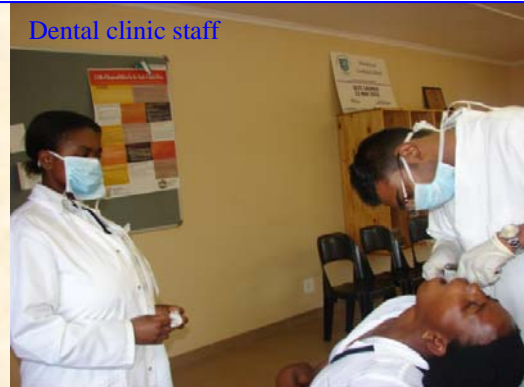
Dental clinic staff