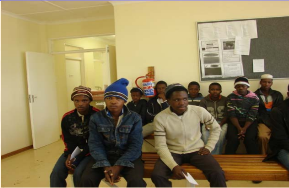
Boys waiting in Sihleza Clinic waiting area