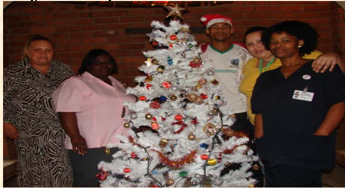
Team decorating the venue