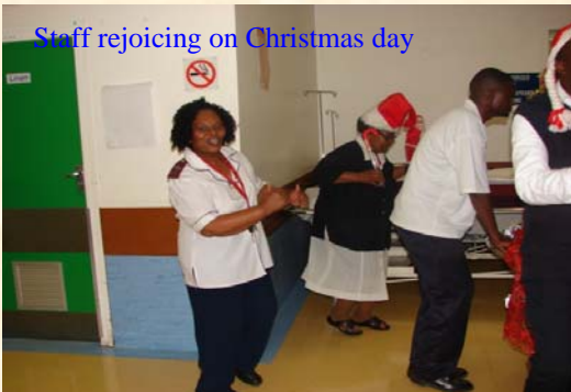
Staff rejoicing on Christmas day