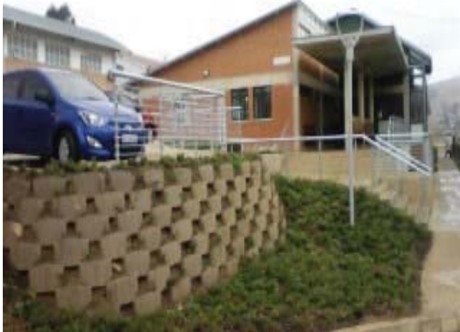
Outside New Philani Clinic