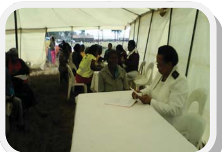
Right ; Dental Clinic