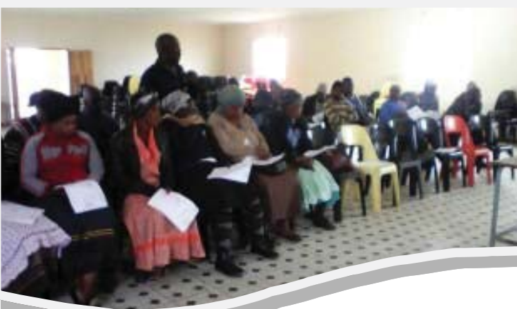
Community members asking questions during Imbizo ward 5 Umzimkhulu