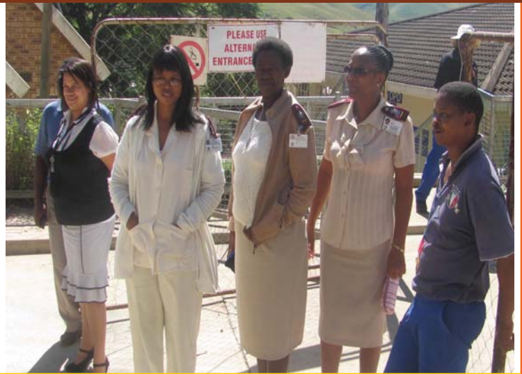
Groups of employees came all out to witness the conducting of a fire drill