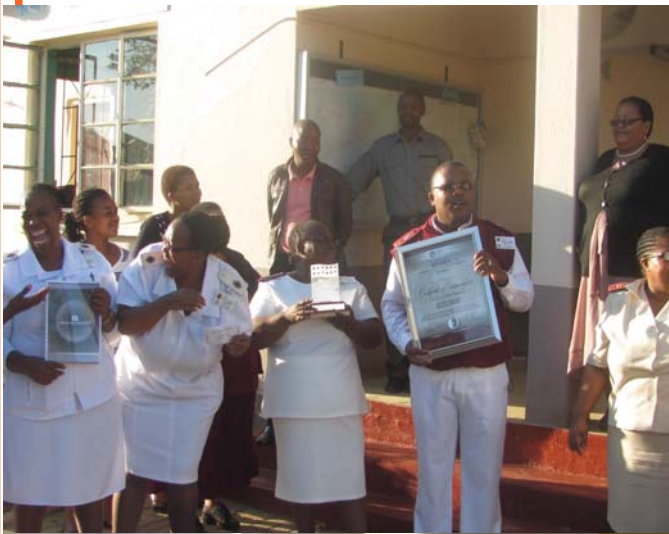
Right : Rietvlei Staff celebrating an award