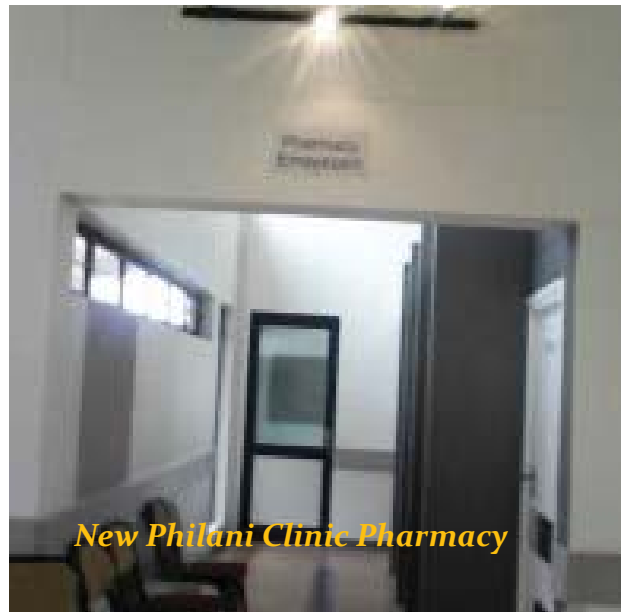
New Philani Clinic Pharmacy