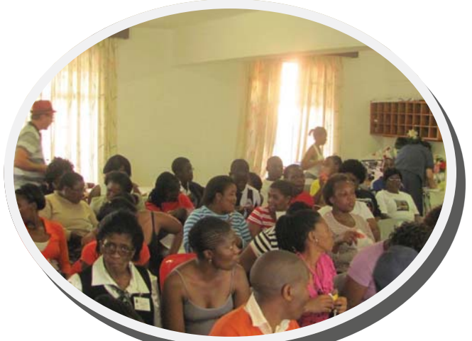
Top : 5km fun walk by Rietvlei Hospital staff Bottom: Aerobics ; Left : Rietvlei Staff at the Hall for formal presentation.