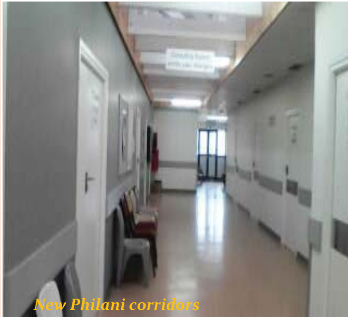
New Philani corridors