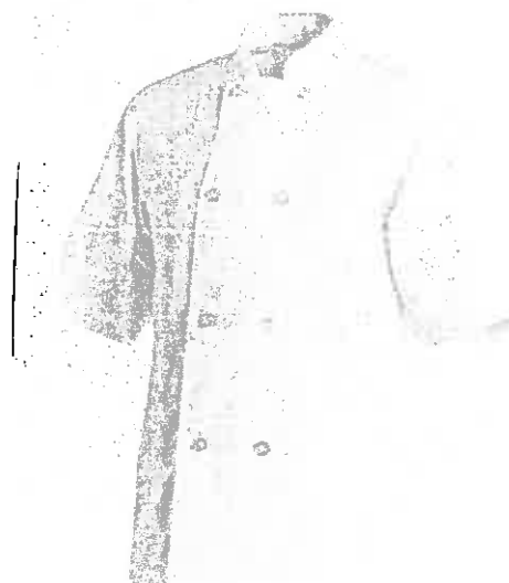
Basic Chef's Jackets Short Sleeve