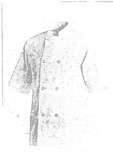
Basic Chef's Jackets Short Sleeve