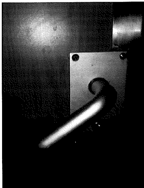
Figure 1: Door handle and locking mechanism.