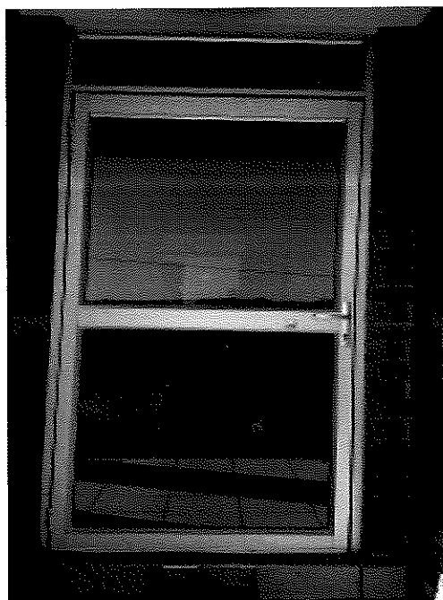
Figure 2: Aluminium Door.