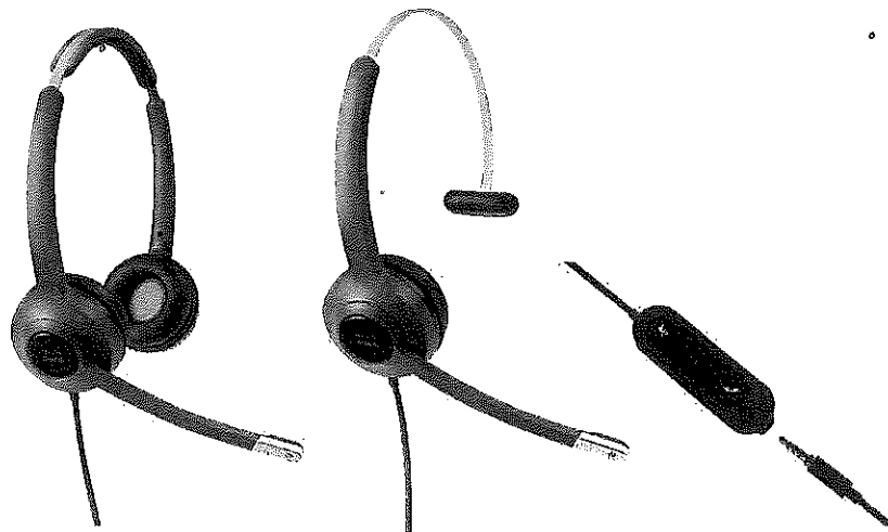
Figure 1. Cisco Headset 521 and 522 and in-line USB adapter

* Feature requires a USB interface for headsets and a compatible Cisco IP phone and firmware, or a compatible Jabber version.