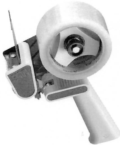
hand-held tape dispenser