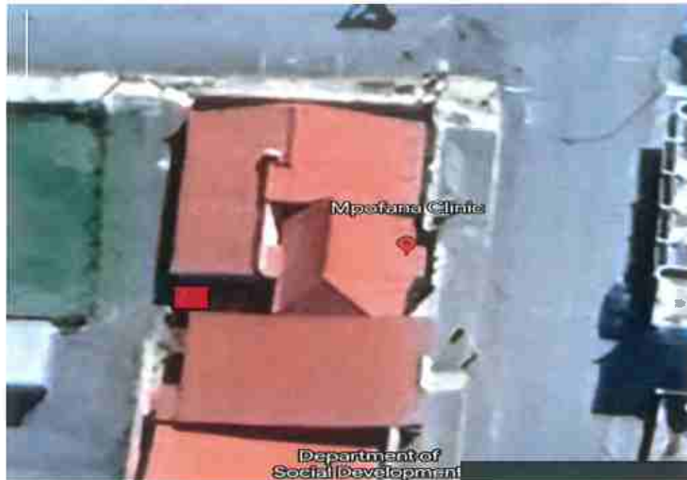
Figure 1: Generator Position in Red

Tenderers are advised to acquaint themselves with the site conditions including access, as no claim on the grounds of want of knowledge will be entertained.