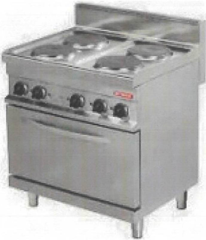
4 Plates Industrial Stove with Oven