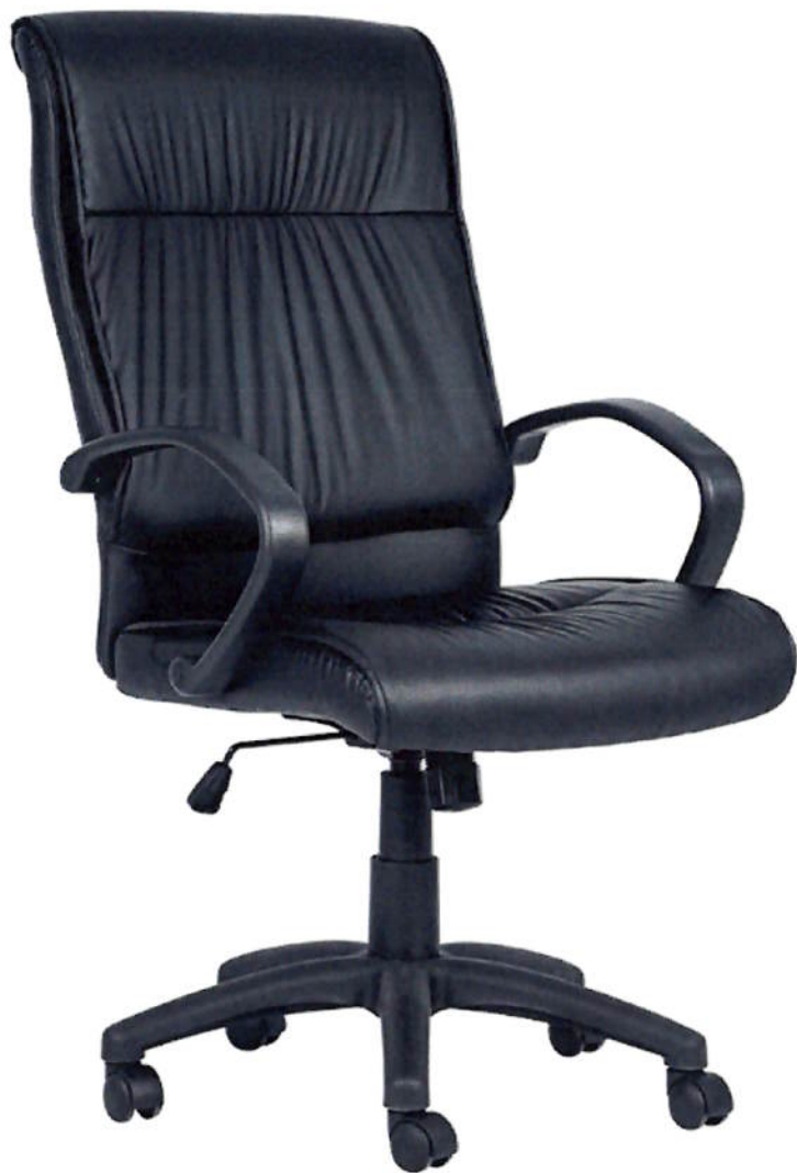
Goose high back