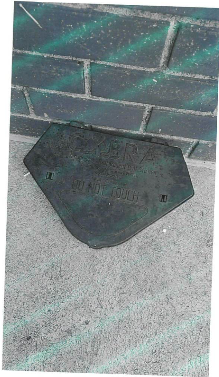
Temper proof 3 compartments rodents bait stations to be installed.