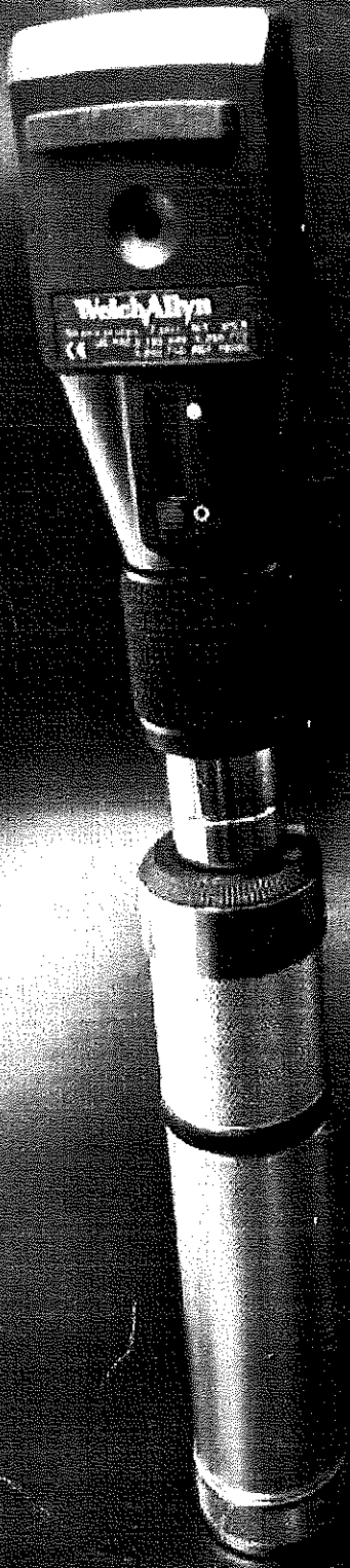
Welch Allyn 3.5 volt Streak Retinoscope with Plugin Handle - EUC