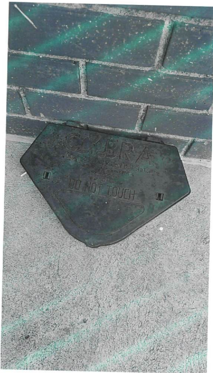
Temper proof 3 compartments rodents bait stations to be installed.