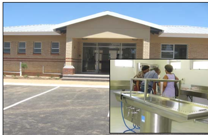
Isikhungo samakhaza kahulumeni esakhiwe eKokstad, kwesincane itray lapho kuhlazelwa kona izidumbu

ukusebenzela kulesikhungo khona maduze nje njengoba kusenziwa amalungiselelo. Umnyango wezempilo kulesifunda iSisonke usaqhubeka nokwenza amalungiselelo okwakha izikhungo ezifana nalesi esiseKokstad eXobho kanjalo naseBulwer.