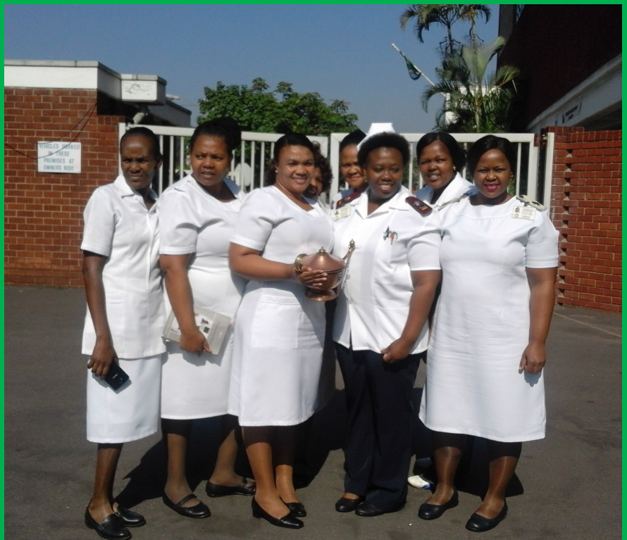
St Aidan's Nurses with the Florence Nightingale Lamp