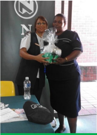
Nedbank Hamper Winner