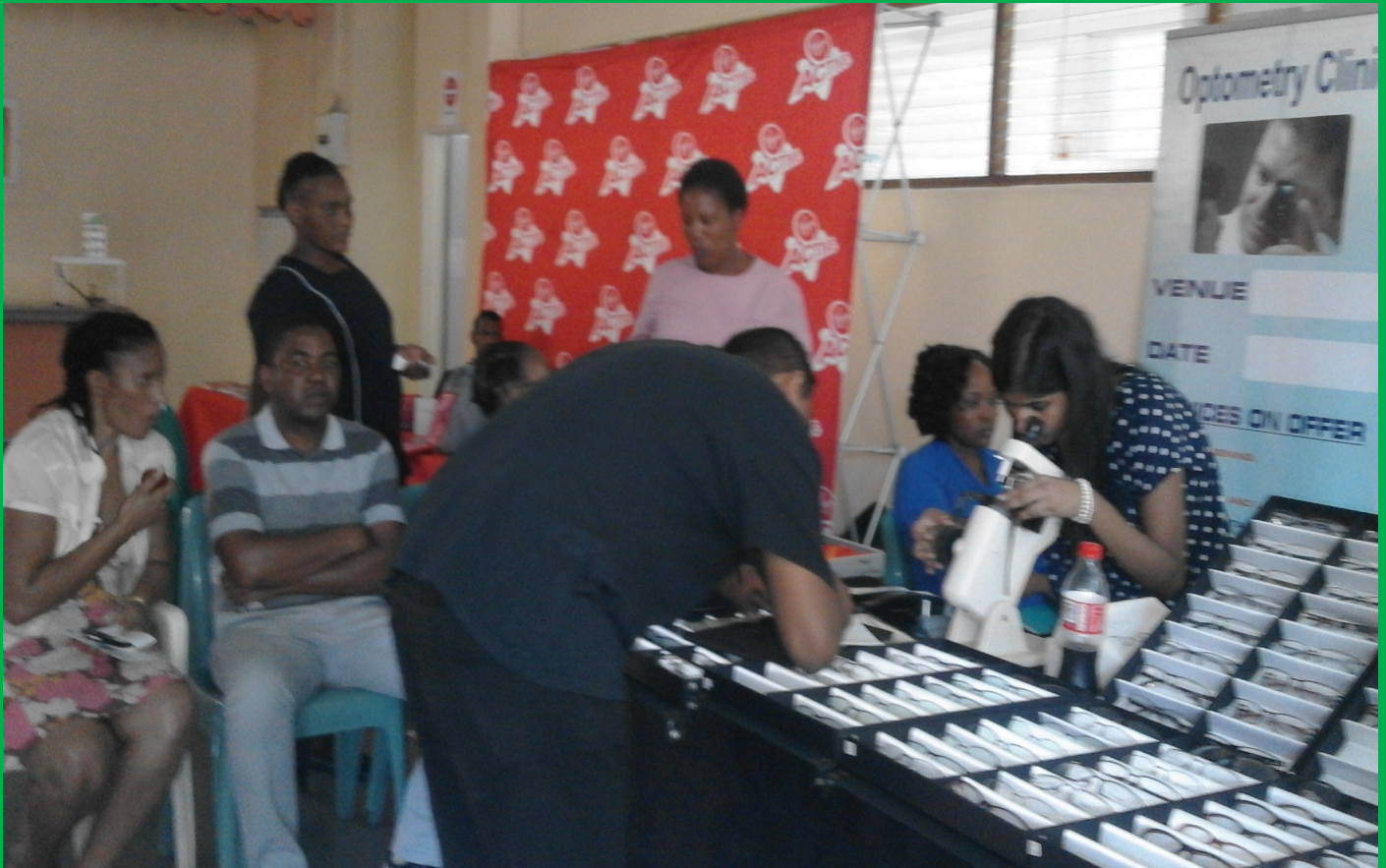
Staff queuing for eye test

In promotion of the Employee Health and Wellness programme, the office of the PRO organised a Wellness Day for all the employees. The aim of this day was to promote a healthy lifestyle in all aspects of life.