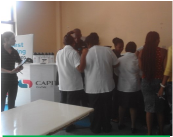
Employees queuing for Capitec services