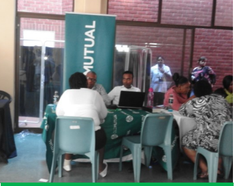
Old Mutual consultants attending to staff enquiries