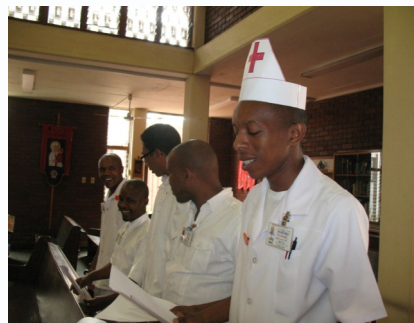
Nursing students with the NURSE alphabets

I thank you for the word NURSE (5 students swayed down the aisle with the alphabets NURSE , while the song 'I want to be there' was sang in all its glory)