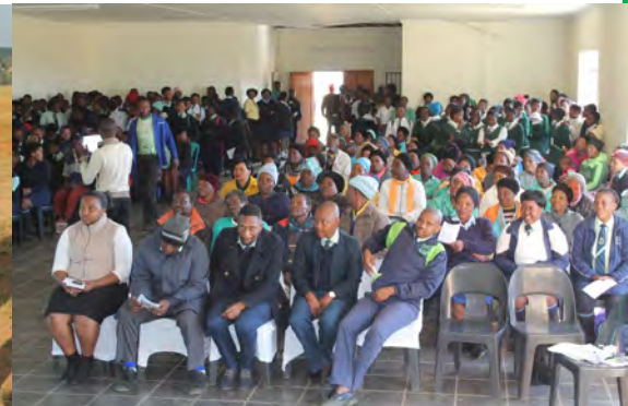
Kilmun Clinic youth day... READ MORE ON PAGE 12