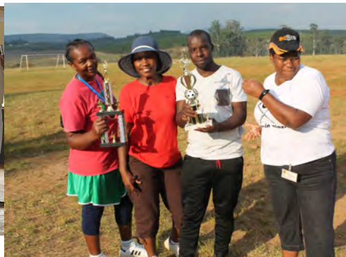
St. Apollinaris Hospital wellness.. READ MORE ON PAGE 5