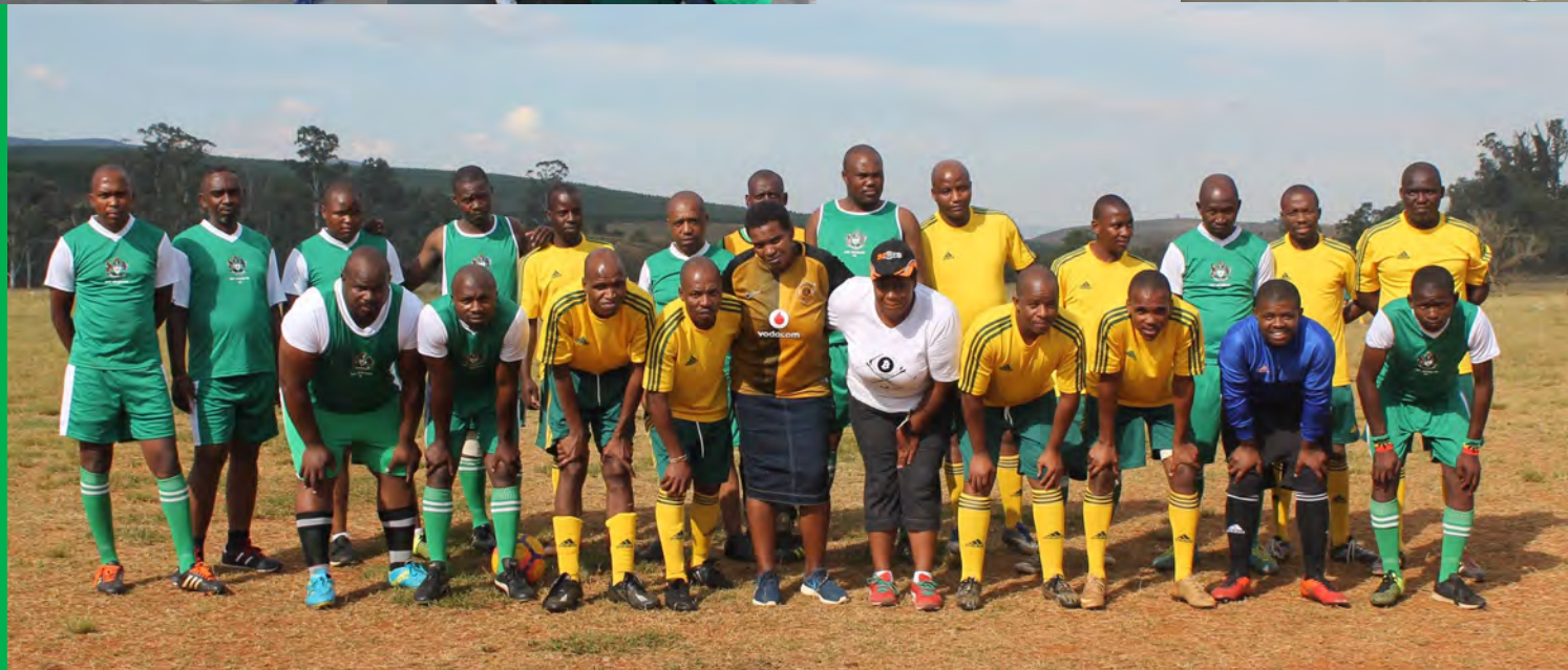
The St. Apollinaris Hospital team together with clinics/ Mobiles squad before the match.

On the 3rd of May 2017 Wellness department in conjunction with Primary Health Care management organized a wellness day involving all Primary Health Care departments under St. Apollinaris Hospital, the activities included soccer, netball and athletics. Games were played at Centocow sports fields, with supporting partners like GEMS providing screening to the people.