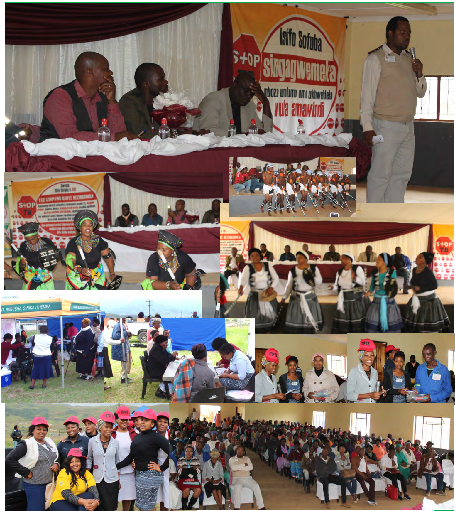
Community came in numbers to listen to the different speakers, also getting an opportunity to check their health status, entertainment was provided by local groups, St. Apollinaris Hospital staff and supporting partners provided services during the event.