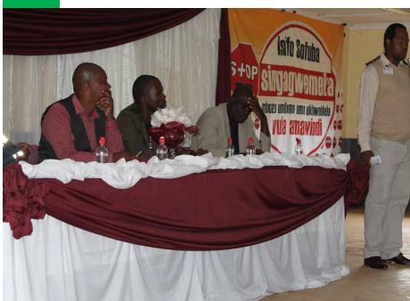
TB Day Awareness..... READ MORE ON PAGE 2