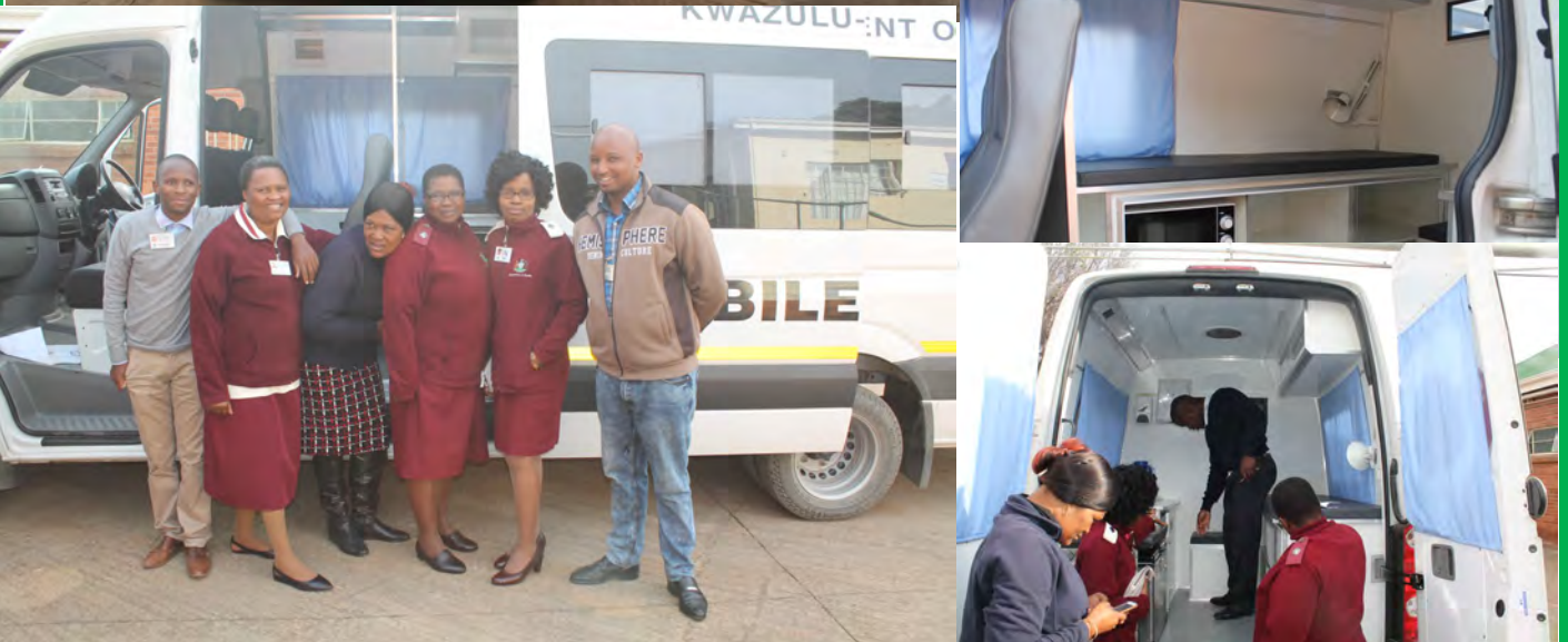
St. Apollinaris Hospital Transport officers and Mobile staff inspecting new vehicle