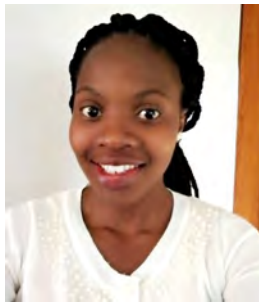
P.M.P Dlamini PRO In-serve Writer/ Photographer