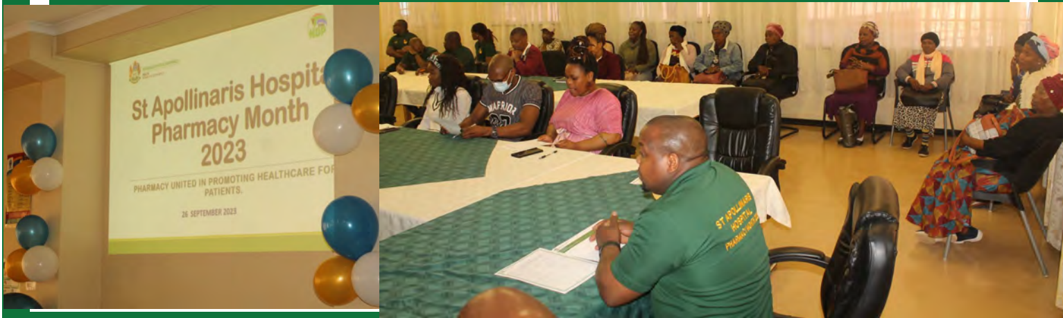
Pharmacy department invited staff and patients to inform them about the importance of adhering to pharmacy guidelines.