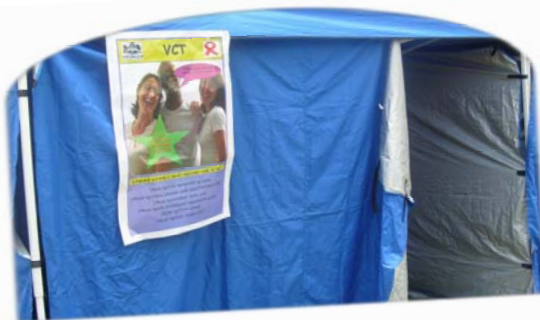
Tents made available for VCT .