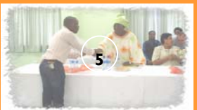
Nkwezela Disaster victims recovery programme event in pics