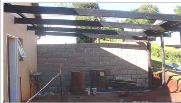
Above: Incomplete shelter at the back of the pharmacy where patients would wait undercover in busy patient days

“The structural design did not however, discourage management to think of how best the facility could be improved to make it accessible and user-friendly to patients and staff”