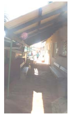
Above: a new shelter connecting the Outpatient and the pharmacy ensuring sheltered walkway.

“The structural design did not however, discourage management to think of how best the facility could be improved to make it accessible and user-friendly to patients and staff”