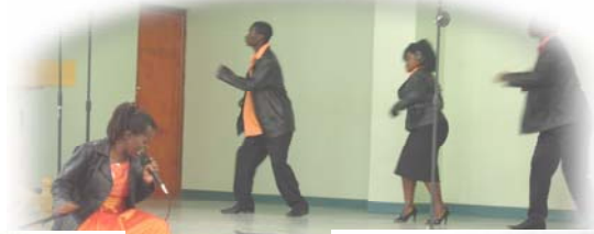
Left: Ma "s" Local Gospel group entertaining the audience.