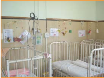
Mobiles installed at the top of each bed for stimulus.

..”mobiles assist in providing visual and auditory stimulation, development of motor skills (for example reaching) and assisting in language development”