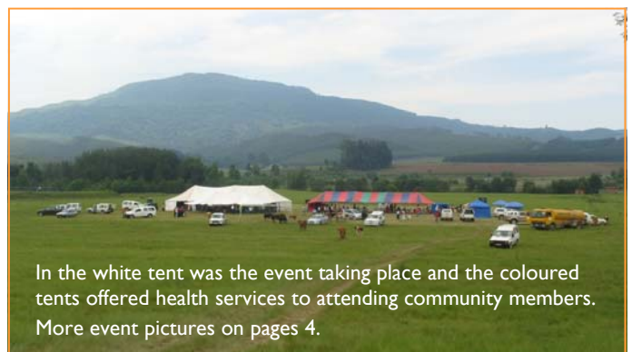
In the white tent was the event taking place and the coloured tents offered health services to attending community members. More event pictures on pages 4.

tested to know their HIV status whilst HIV counselors were onsite to test willing individuals to know their status. T-shirt, water bottles, and other promotional material were issued to people who enticed them to test.