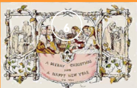
Merry X - Mas and a Prosperous New Year