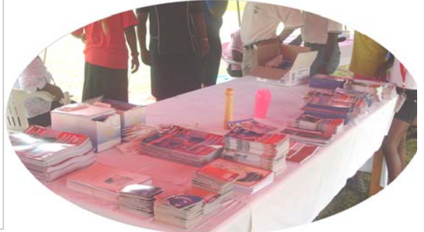
Pamphlets, leaflets, condoms and live demonstration on how to use a condom.