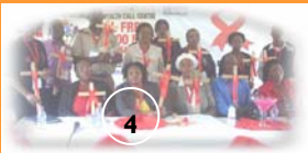
World Aids Day photo gallery