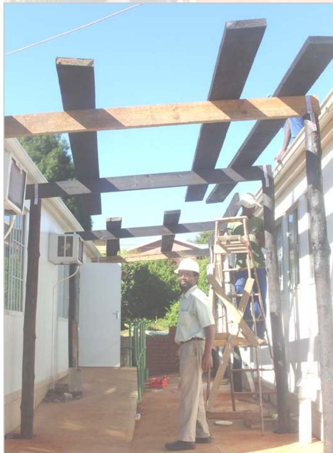
Adjacent: Construction of another shelter which will connect the two park-homes.