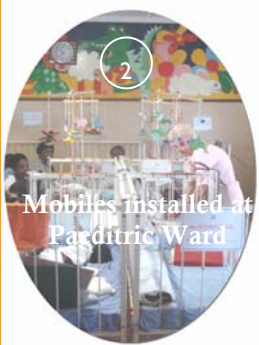
Mobiles installed at Paediatric Ward