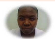
Ngcobo SE- ENA