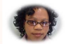
Noguda N HIV/TB Warrior