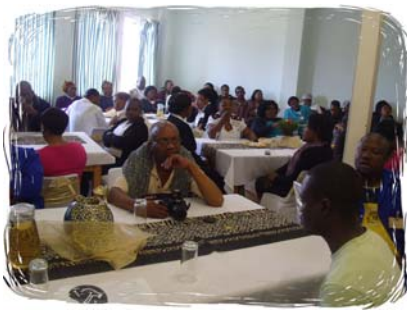
Abasebenzi babephume ngobuningi ukuzothamela lomcimbi

Bavaleliswe ngegiya eliphezulu labo abasebenzele umyango wezempilo ngokuzikhandla iminyaka eminingi kwaze kwafika ekuthatheni umhlalaphansi.