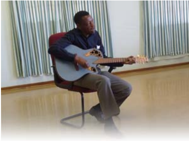
Dkt. Dube - ecula ngesiginci