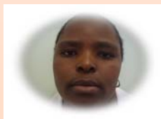
Dlamini FK- ENA