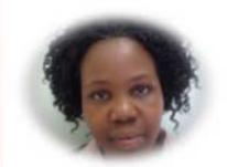
Mlitwa PP HIV/TB Warrior