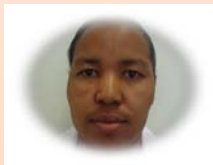
Mncwabe NY ENA