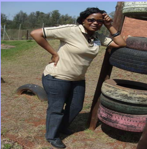
CEO in her relaxed gear!