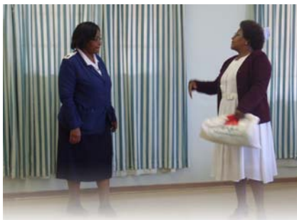
Old timers -isikeshi