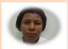
Mncwabe NY ENA