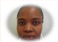
Jili BE ENA