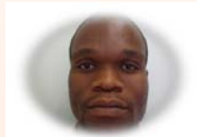
Malinga MC HIV/TB Warrior