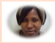
Basi TH Data Capturer