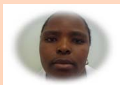
Mkhize NP Professional Nurse