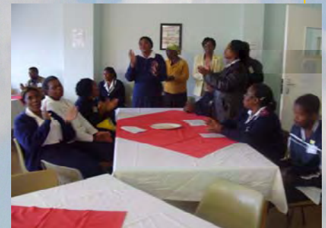
Staff members enjoying the function.