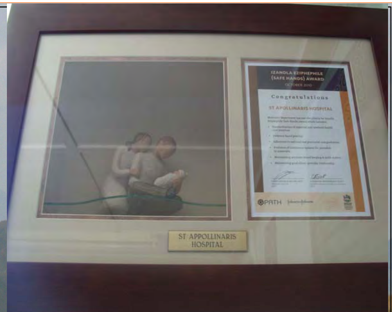
ABOVE : IZANDLA EZIPHEPHILE (SAFE HANDS) AWARD

Maintaining good client provide relationship.