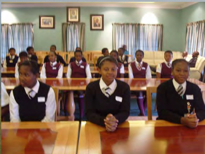
Students were listening attentively as they were being addressed by the Municipal Mayor