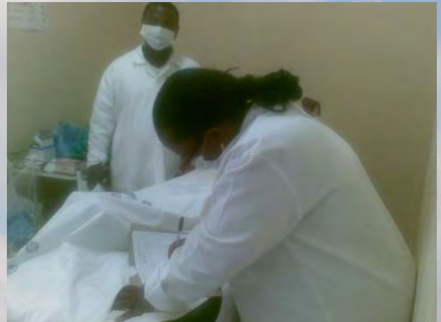
MMC was in progress at Malenge Clinic