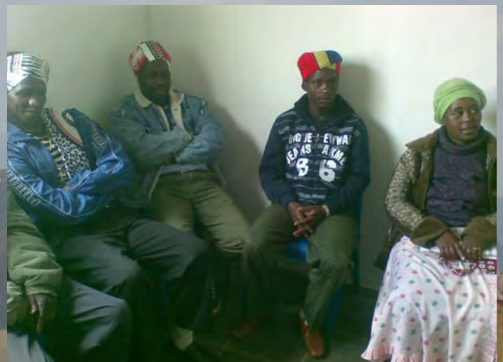
Traditional healers enjoying the training.