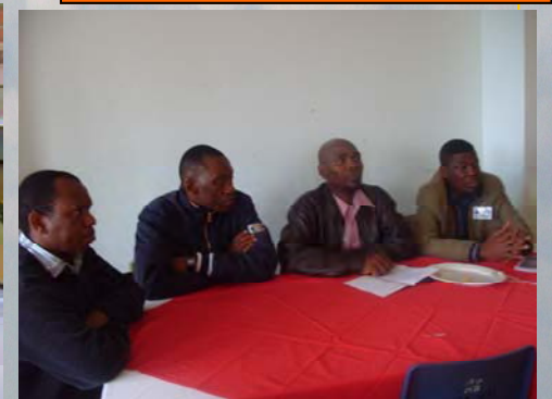
Staff members at the farewell function