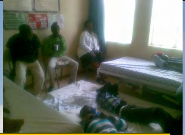
MMC Campaign was completed.

The main objective of this campaign was to circumcise male to reduce the infection of HIV when engaging on sexual intercourse. It has been stated that male medical circumcision is effective and it is essential that circumcised men are encouraged to continue using condoms during sexual intercourse. In this campaign 40 males between 13 -35 were circumcised. 08 were circumcised using surgical-forceps method and 32 were circumcised using Tara clamp.