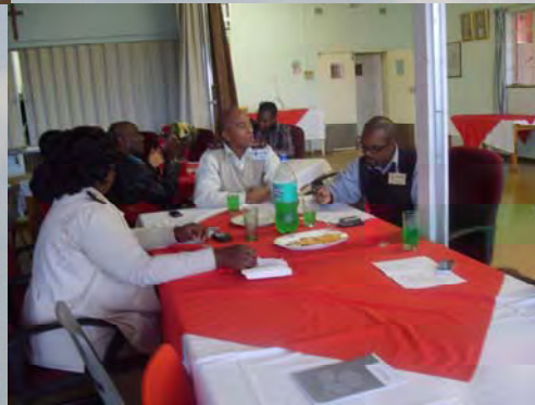
Staff members enjoying farewell