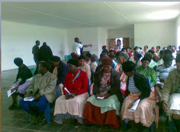
Members of the Community listening attentively