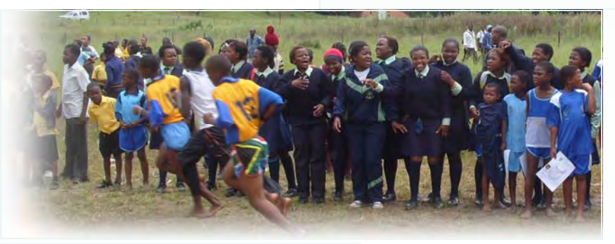
Above: Schools participating in health activities.