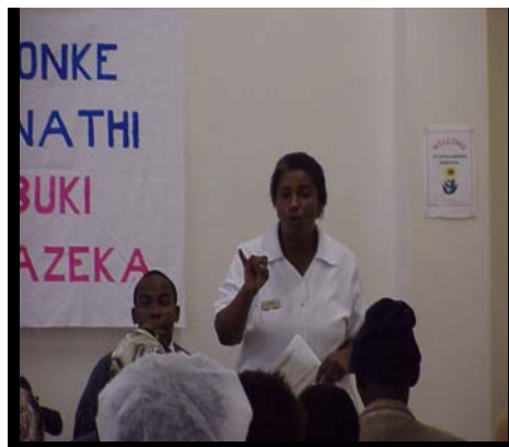
Ms.Sgwebelaa education Client