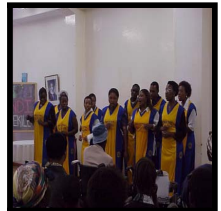
St. Apollinaris Hospital Choir entertaining Guest