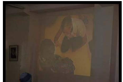
Screening the documentary compiled by Sisonke therapist