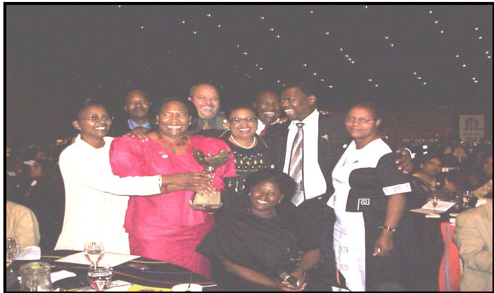
Celebration joined by MEC'S

Premier's Service excellence Awards 2004 proved to be a success to St Apollinaris Hospital on the 5 th November