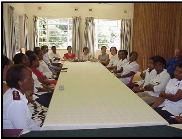
New Staff Members Who have Joint St. Apollinaris