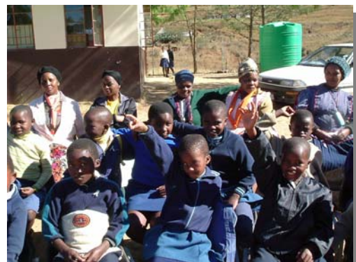
Above: Emnqundekweni pupils enthusiastically answered questions