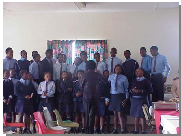
Choresters from a Local school (Centocow High School) who entertained the audience throughout.

"Fighting Disease, Fighting Poverty, Giving Hope/ Silwa Nezifo, Silwa Nobubha, Sinika Ithemba".