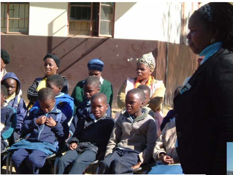
Above: Rape crisis counsellor shares her knowledge with pupils