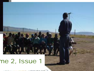
Across: Creighton police tell pupils to say 'No' to child abuse