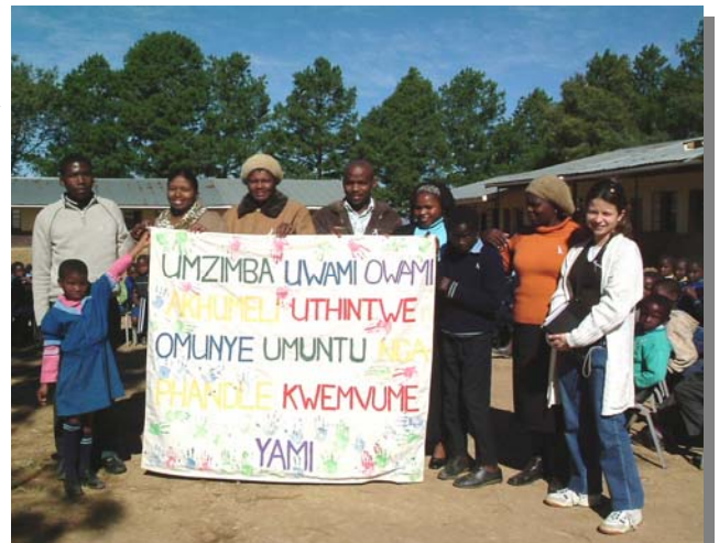
SAH, bulwer police and Emnqundekweni school celebrate

"Umzimba wami owami, akumele uthintwe omunye umuntu ngaphandle kwemvume yami."