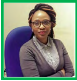
ZAMA SIBISI PHOTOGRAPHER DESIGNER &