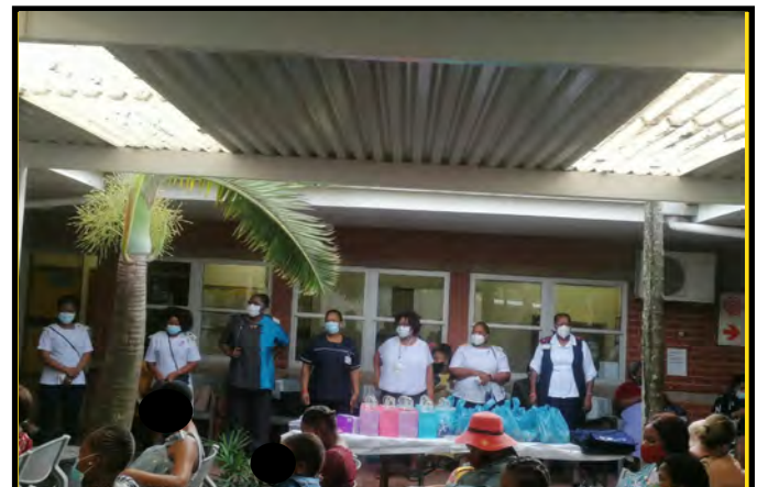
ITHIMBA LABASEBENZI BEKILINIKHI