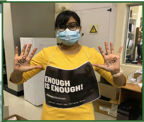
POSTERS BY PHARMACY STAFF