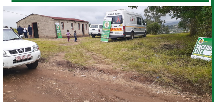
Covid-19 vaccination points