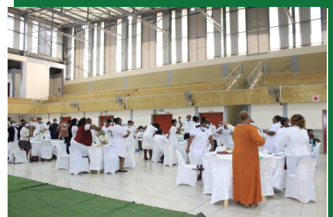
A beautiful and joyous moment