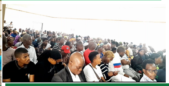
Attendance during the WAD in Isithebe area.