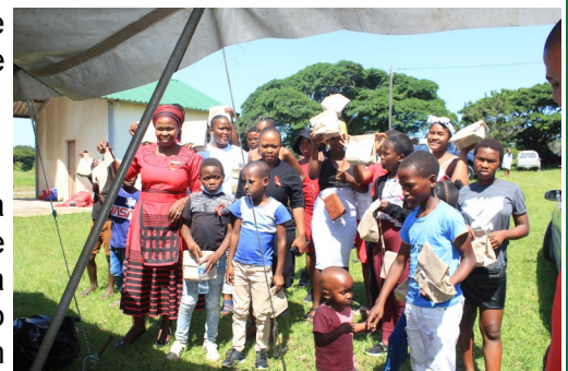
Children received gifts from Department of Social Development

The event was a success, the community benefited a lot, there were also services provided on site for the day.