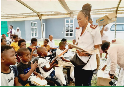
Department of Health in Mandeni Sub-district handing out gifts courtesy of Freedom stationery during the World Aids day in Isithebe Area on the 13 December 2022