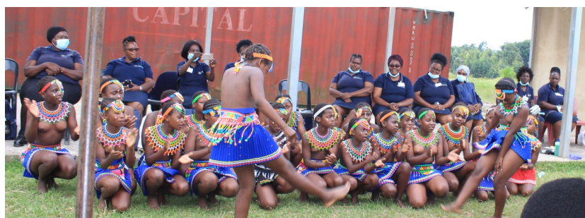
Entertainment from izimbali zezizwe samaCambi group