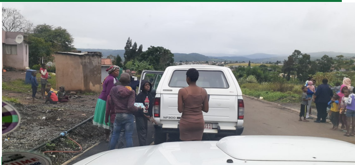
Outreach teams doing child immunization recovery and Covid19 vaccine