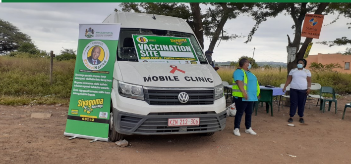
Covid-19 vaccination points