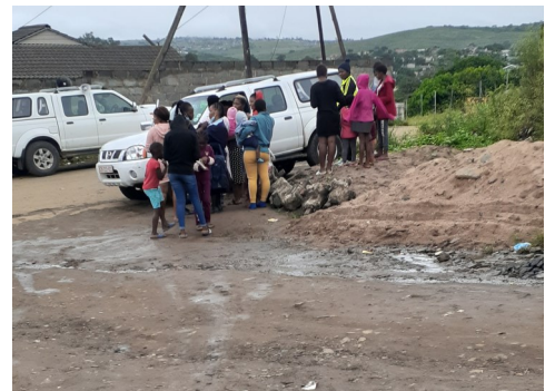
Outreach teams covering the hard-to-reach areas