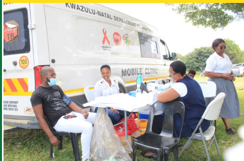
Services were provided to the community and attendees