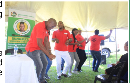
Macambini Clinic staff during their educational musical item

NPO's that work with the youth who are either affected or infected with HIV were also present and shared some wonderful insights and wonderful testimonies as proof that you can live a normal life even if you're infected with HIV.