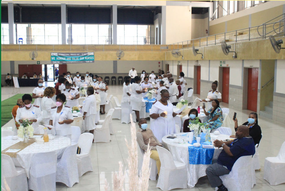
Nurses during the revival of the nurses pledge

NURSES A VOICE TO LEAD INVEST IN NURSING AND RESPECT RIGHTS TO SECURE GLOBAL HEALTH