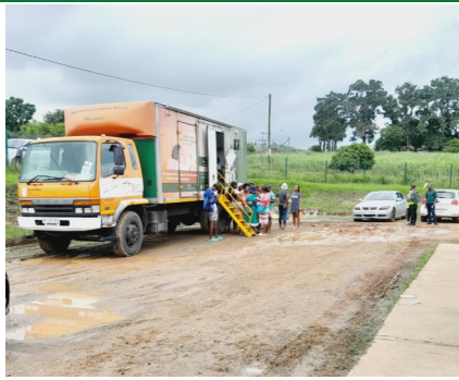
Department of Health and Home Affairs were offering services on site during the WAD in Isithebe area.