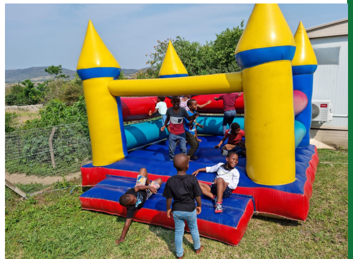
Fun in the castle

Grocery hampers were put together and distributed to clients and elderly. Fresh fruits were also given to all patients in the different waiting areas. Sanitary pads and hygiene packs were also distributed to school going girls.