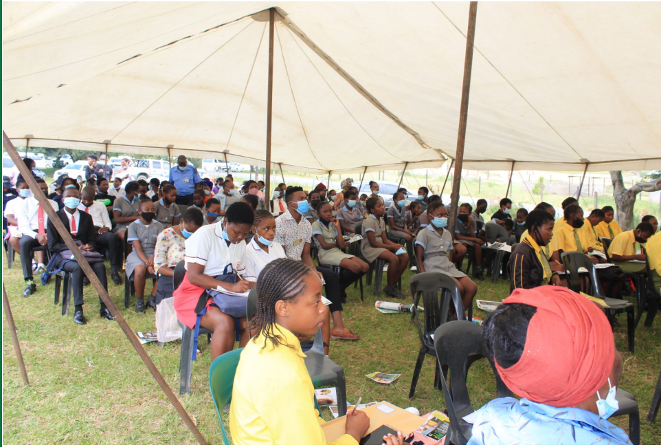
Youth of Macambini area from different local schools

advice as he is always very fond of the youth of Macambini area. He also encouraged the youth to walk in groups for safety purposes. He also educated parents who were present to refrain from drinking in front of their children, hence that will make children think it's a good thing to do for fun.