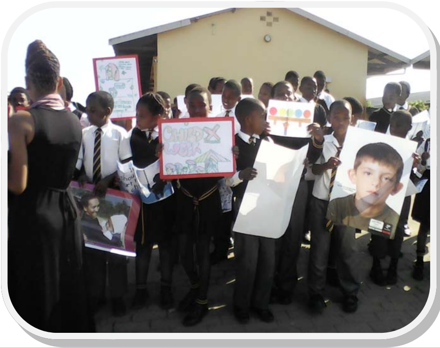
Sundumbili Primary School getting ready for an awareness walk