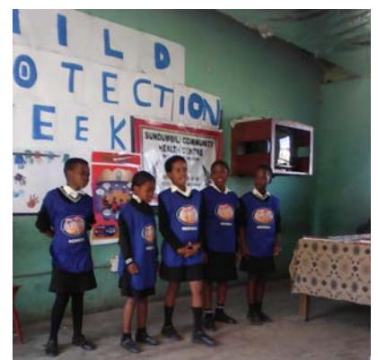
Cranburn Primary School learners presenting the children's rights

Much appreciation to the stakeholder who participated to make the awareness campaign a success.