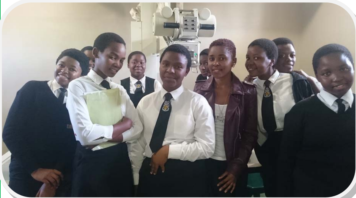
Uthukela High School female learners with the radiographer at X-Ray department

On the 26 th of May 2016, Sundumbili CHC hosted 30 female learners from Uthukela High School. The aim for the Take a Girl Child to Work Day is to encourage young female learners who are doing Science studies between grade 11 & 12 to venture into health-related courses and also to market the DOH's bursaries.