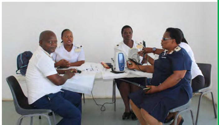
Nurses who provided services on site