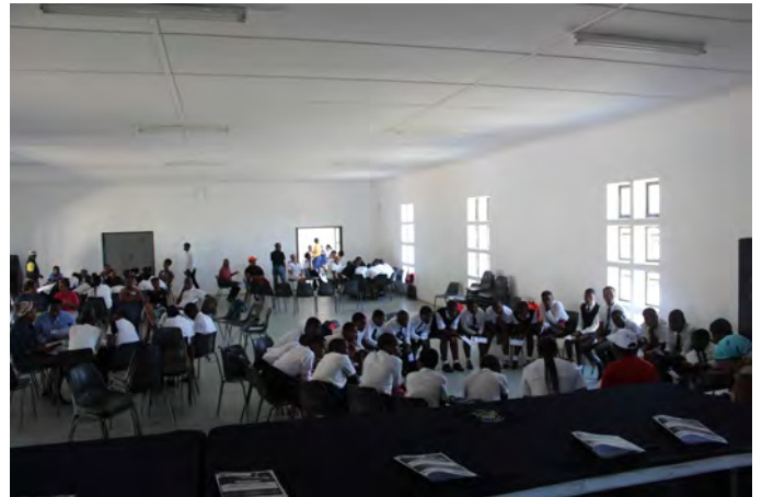
Groups during discussions