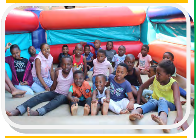
Children resting in the jumping castle