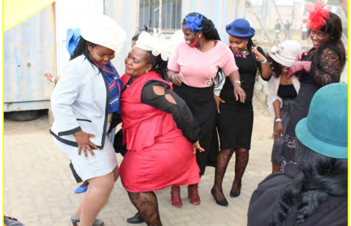
Left: our little venue and right: the pata-pata dance