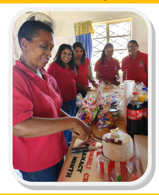
Cutting of the cake for the kids