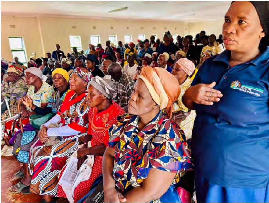
Top left: Community members listening attentively to speakers. Bottom left: Department of Home Affairs assisting clients. Bottom right: SASSA assisting clients.