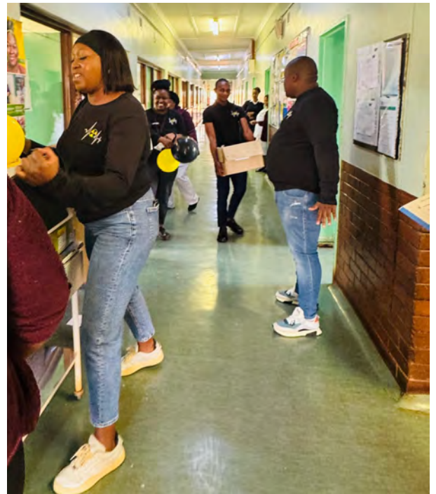
Radiology Department team and PRO in Paediatric ward.