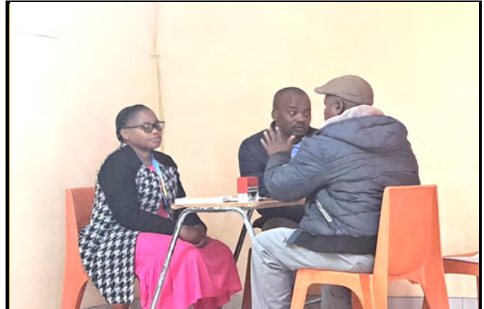
SASSA officials assisting the client.