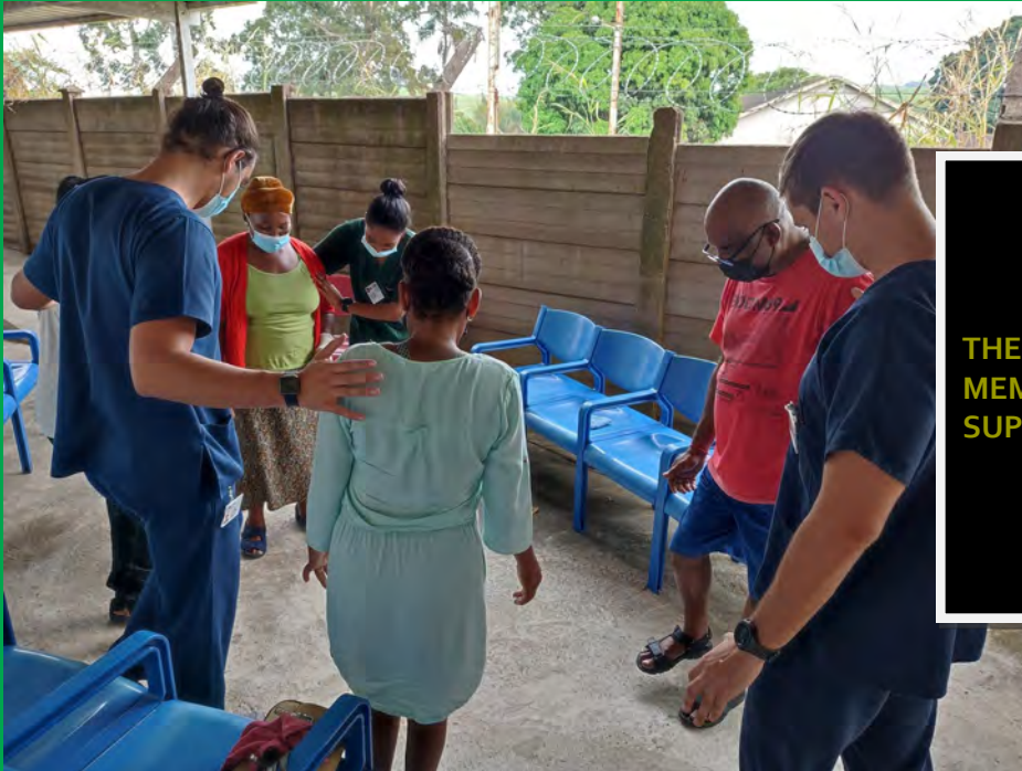
THE REHAB TEAM WITH MEMBERS OF THE STROKE SUPPORT GROUP.