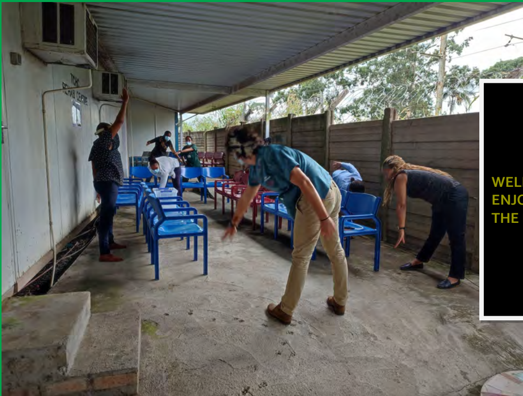
WELLNESS GROUP ENJOYING EXERCISES BY THE PHYSIOTHERAPIST