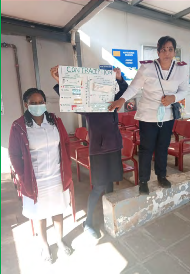
Youth Day Celebration by the AYFS team and the Audiologist raising awareness on safe sex, contraceptives and all the services available to the youth.