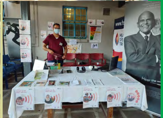
Autism awareness day at the