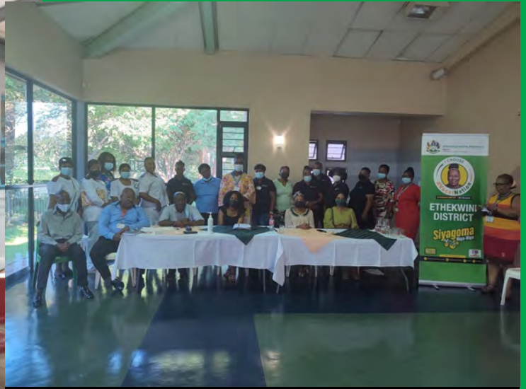
National, Provincial and District team visited Tongaat CHC for COVID-19 vaccination meetup with CHWs and community leaders.