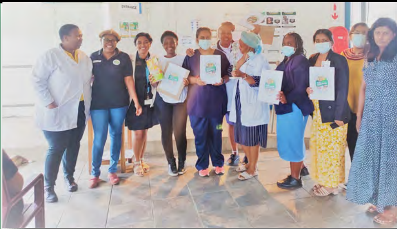
2nd prize to the Pharmacy department