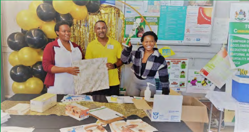
MCWH Team displaying their services