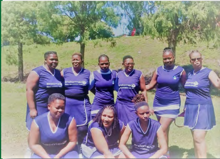
Tongaat CHC Netball Team