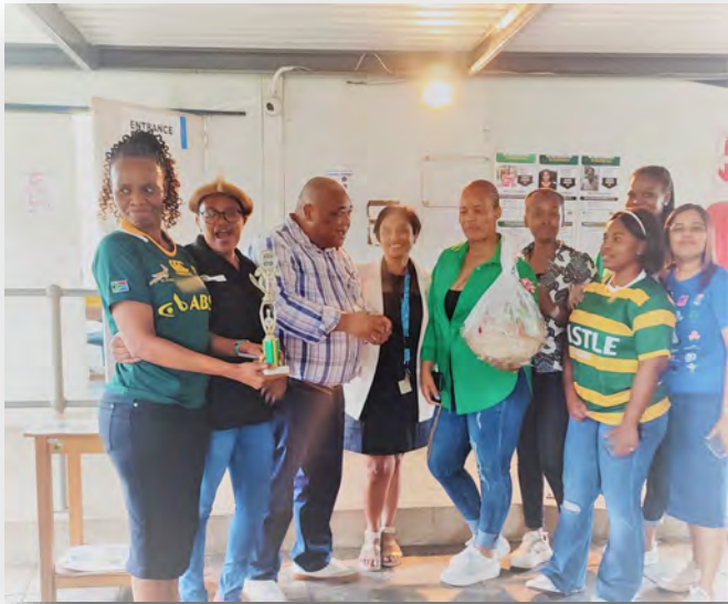
HR department receiving their prize for position 1.