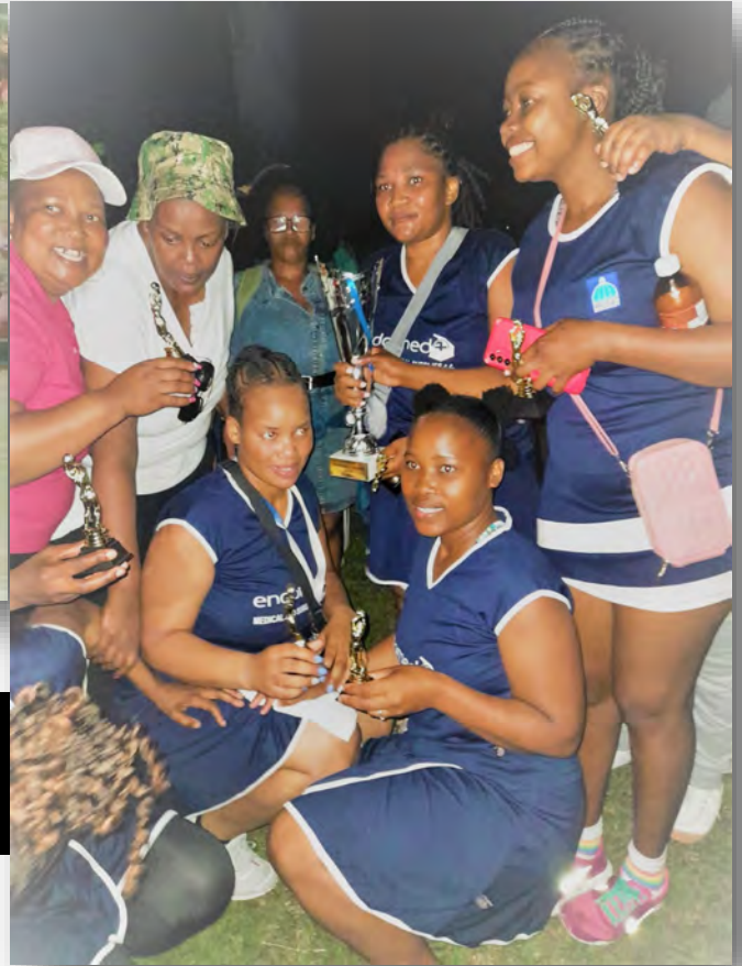
After the trophy ceremony