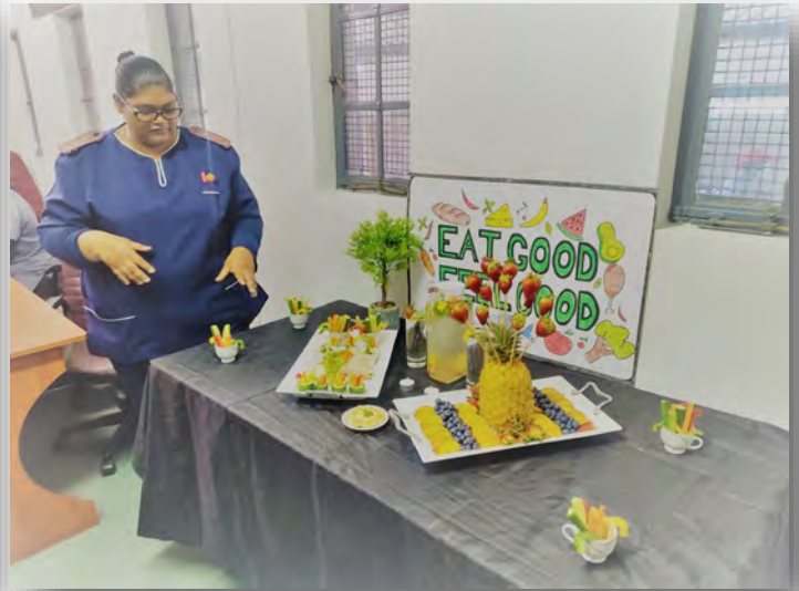
Presentation from Outreach services