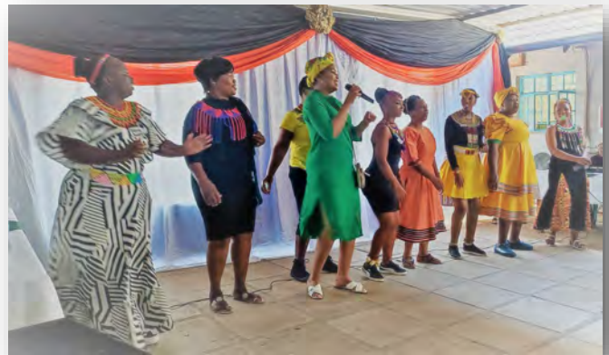
MCWH staff performing