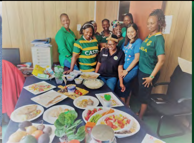
HR during the presentation with the Nutritionist