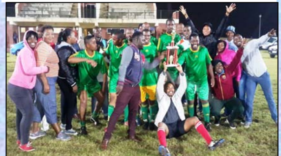
Townhill hospital jubilant players in celebration