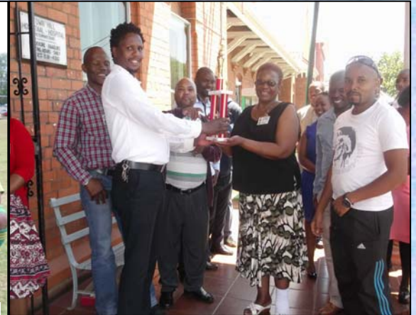
CEO receiving the Trophy from players