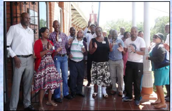
Celebration for the winning team THH players