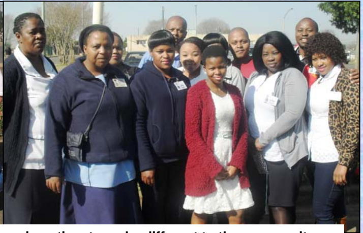
These are all men and women who devoted their precious time to make different to the community

Being a public servant means that one should move away from comfort zone and go to the community with the aim of listening and educating them on social ills they face on daily basis. Again if the community is empowered with knowledge, they can be able to make informed decisions during those difficult times. Indeed knowledge is power.