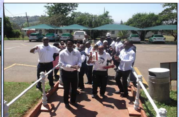
"Townhill le abayaziyo abazange bayibone"