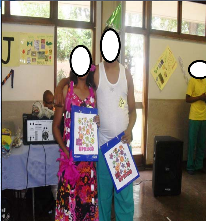
Mr and Miss Townhill Hospital Spring 2015

The annual Spring Dance was held for the Town Hill Hospital Mental Health Care Users (MHCUs) on Wednesday 2 September 2015. This forms part of the annual Therapeutic Events Programme run by the OT department. The event was a success with 113 MHCUs attending and MHCUs reported to enjoy the event.