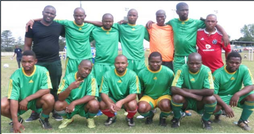
TOWNHILL HOSPITAL SOCCER TEAM

On the 23rd of October 2015 UMGungundlovu health district hosted District Sports Tournament in preparation of Provincial sports tournament that will be held on the 20th November 2015. Townhill Hospital soccer team reached the finals where they beat Appelsbosch hospital soccer team through penalties by 5 goals to 3 after playing to a 0-0 draw.