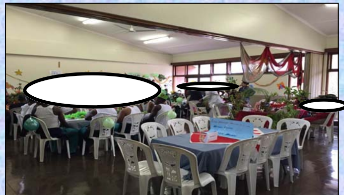
Some of the Mental Health Care users enjoying themselves during the dance

The OT department would like to extend sincere thanks to all the wards who put in amazing effort to participate and assisted in making the event the success that it was. In addition thanks should be given to all departments who assisted OT with event related requests, which were all dealt with quickly and efficiently making it easy to run the event on the day.