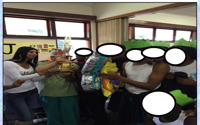
Staff member and some of the MHCUs showcasing with the trophy they won.