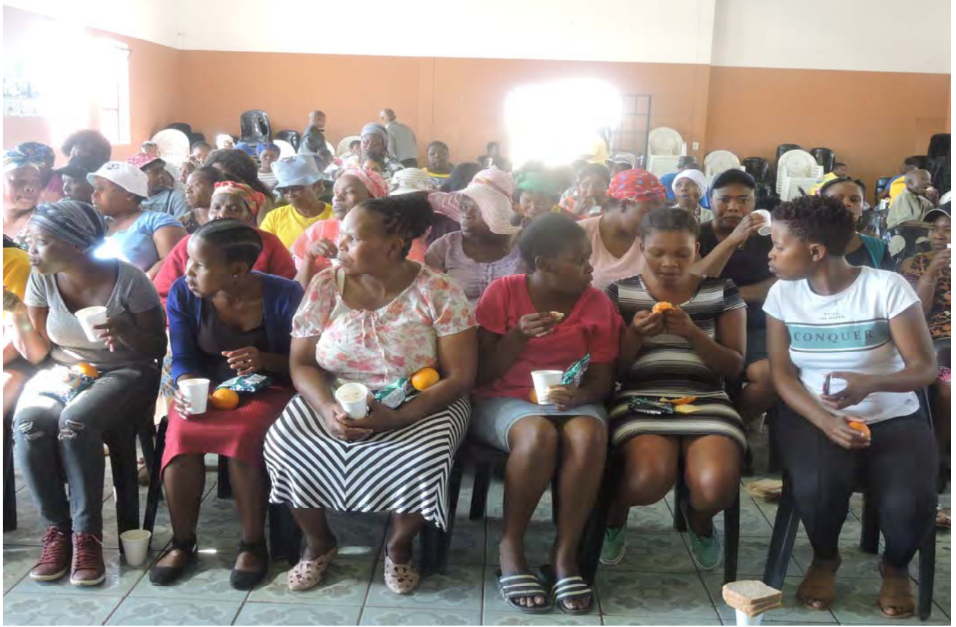
Part of the audience that attended Townhill hospital Mandela day commemoration