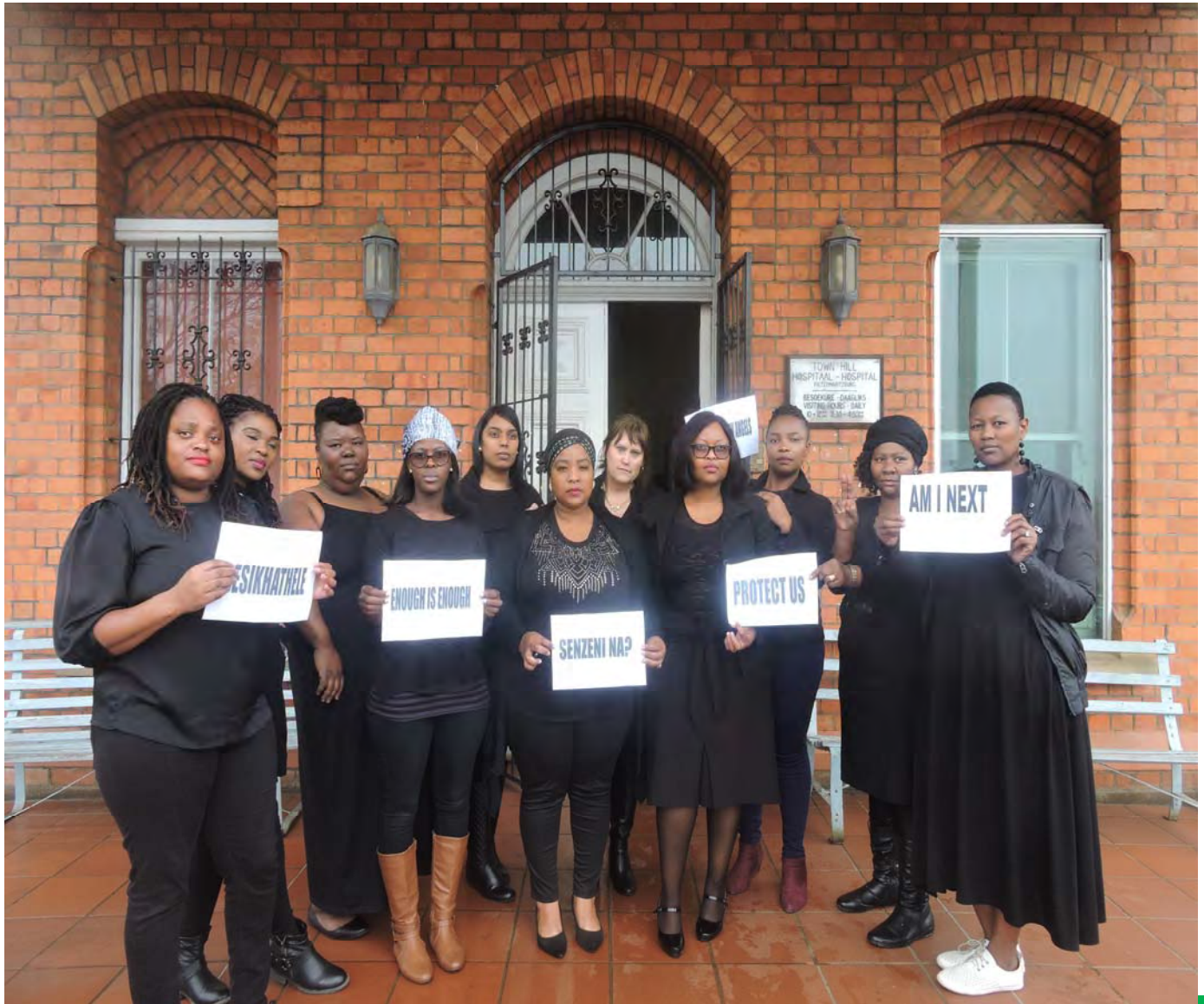
Some of Townhill hospital women who were wearing black attire in solidarity of all women and children who suffered and died through gender based violence

The plight of women and children abuse is one of the biggest challenge facing our government. Indeed the government has initiated and implemented all sorts of programmes aimed at eradicating this scourge . But what is most fascinating is that South African women are not folding their arms and wait for the government to do everything for them. They have taken it upon themselves to say enough is enough.