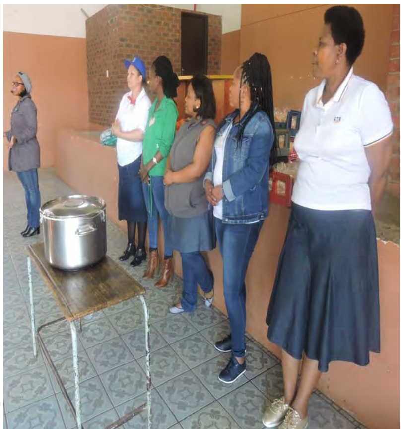
Townhill hospital team during 67 minutes Mandela day

Townhill hospital management encourages all Townhill hospital staff members to be part of this yearly event. Management believes that this is the only way of honouring UTata Mandela for his sacrifice for the people of this beautiful country. As public servants, we are duty bound to constantly communicate with the members of the public through such indicatives. Such exercise enhances the relationship between government institutions and the community at large. We hope that next year we will be able to reach more communities members through the honour of our former president