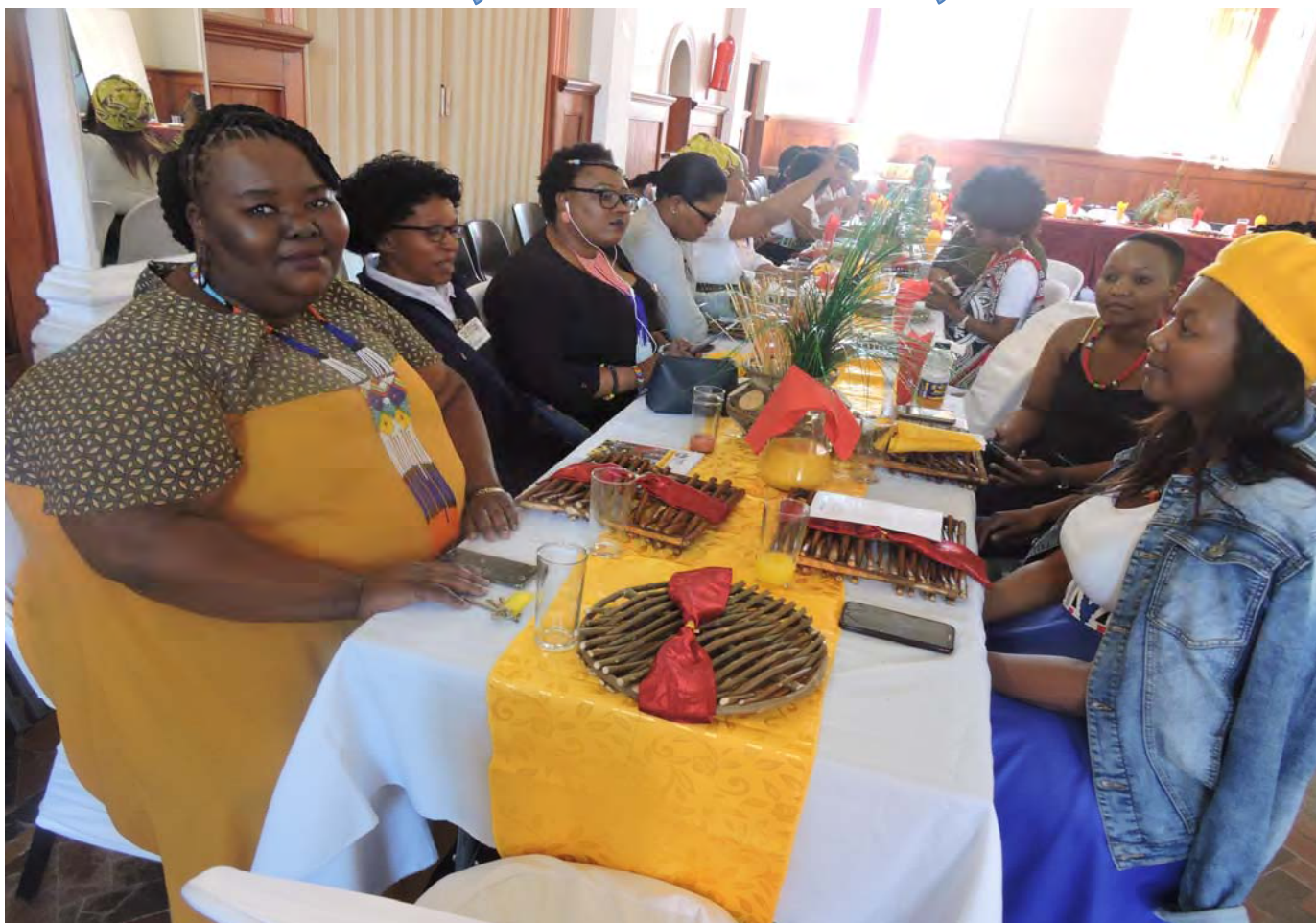
Part of the audience which participated in the heritage day

Heritage day is one of the South African national days which is aimed at encouraging people of South Africa to celebrate their culture and traditions. South Africa is one of the countries with rich cultural diversity which makes us a rainbow nation. This day is held on the 24th of September every year. During this month all South Africans are encouraged to celebrate this day.