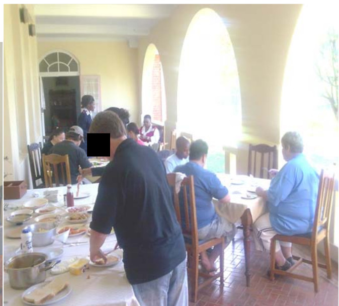
ONE OF OUR MHCU ENJOYING HIMSELF