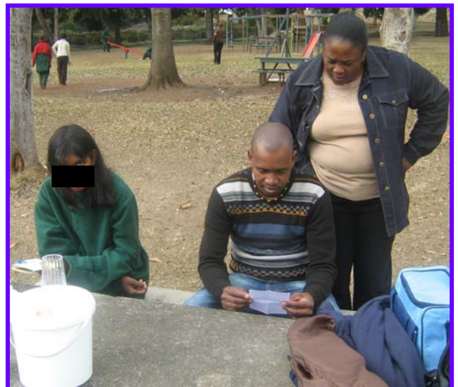
Some of the staff members chatting with one of the patients