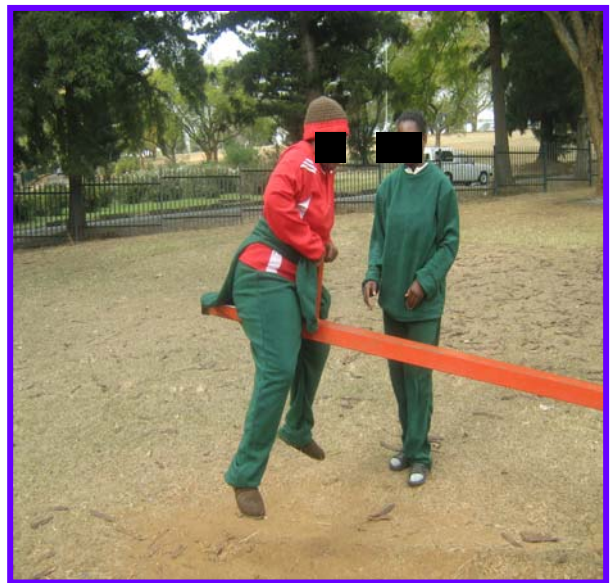
MHCUs enjoying themselves