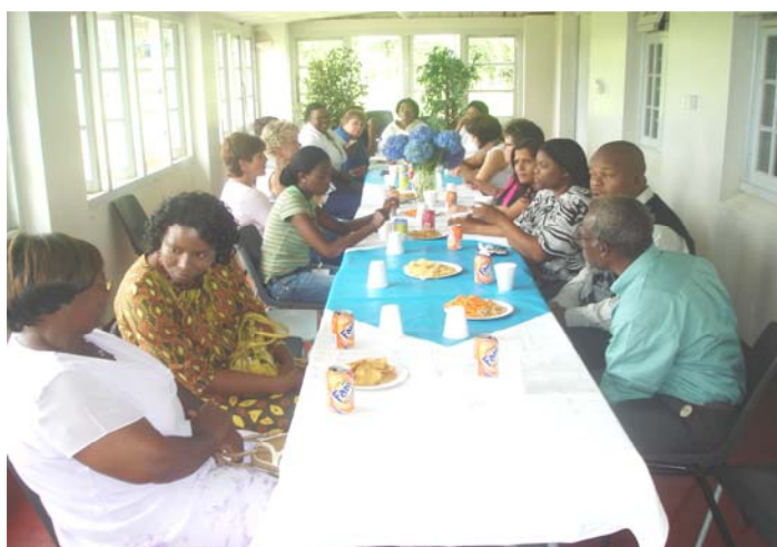
Some of the people who made the function possible