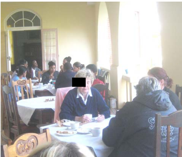
PATIENTS AND STAFF ENJOYING THEMSELVES