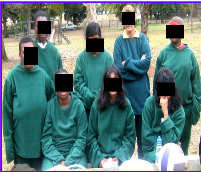
Patients ready for the fun