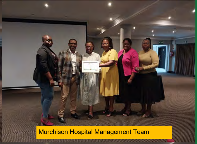
Murchison Hospital Management Team