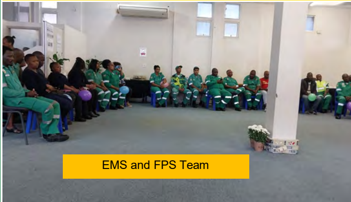
EMS and FPS Team