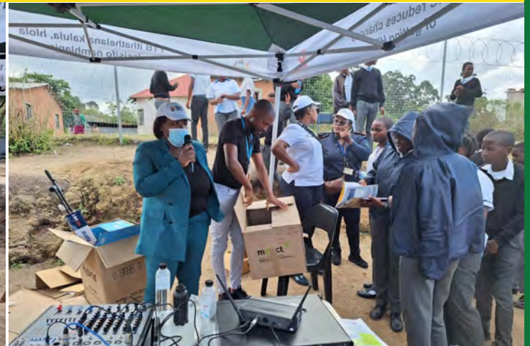
Abafundi balulekwe ngokuziphatha