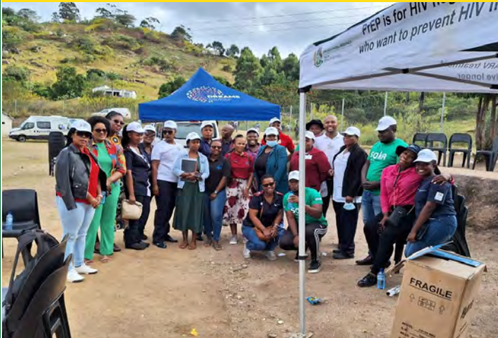
Ithimba labasebenzi abanikeze usizo lwezempilo