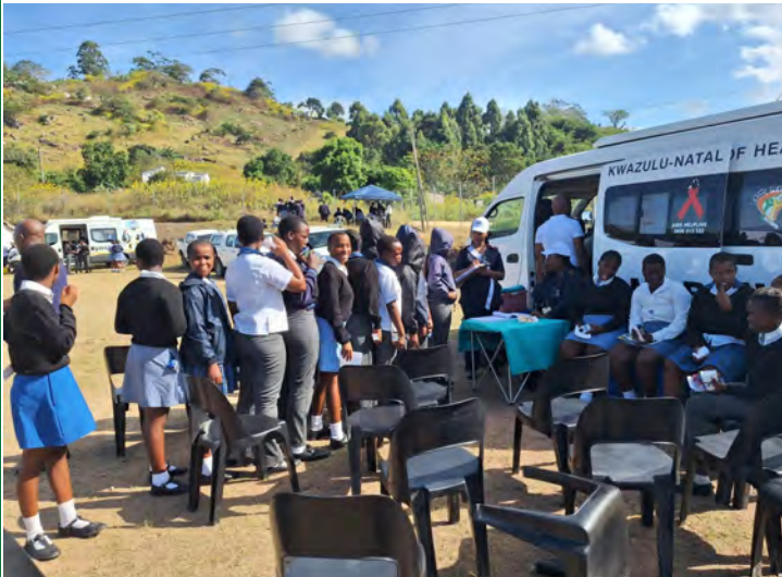
Abafundi bakulangazelele ukuthola usizo lwezempilo