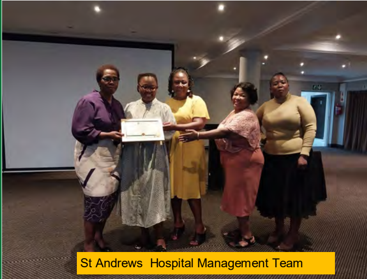
St Andrews Hospital Management Team