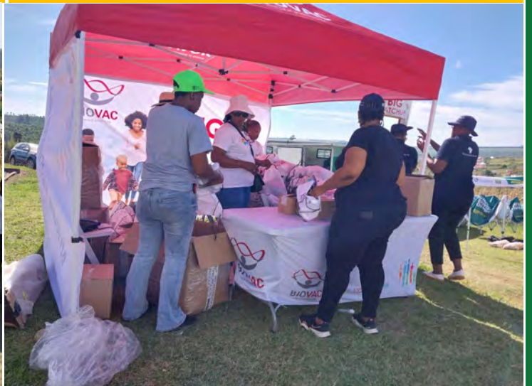
NGO also supported the Vaccination Week