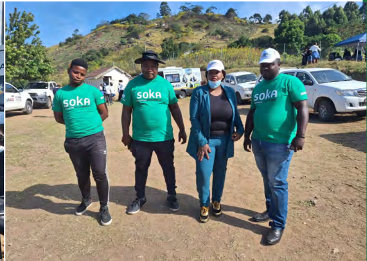
Kugqugqazelwe ukusoka kwabafana

Bangaphezu kuka-350 abafundi ababonwe uMnyango weZempilo esikoleni l Inani endaweni yase St Faiths kuMasipala Umzumbe ngenhloso yokubaqwashisa ngokukhulelwa kwabantwana besebancane noma besasesikoleni. Lokukuqwashisa kuhlelwe ithimba elisebenzisana nezikole ngomhlaka 5 May 2023.