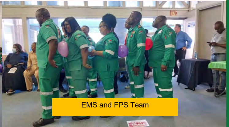
EMS and FPS Team