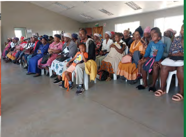
Community came in numbers