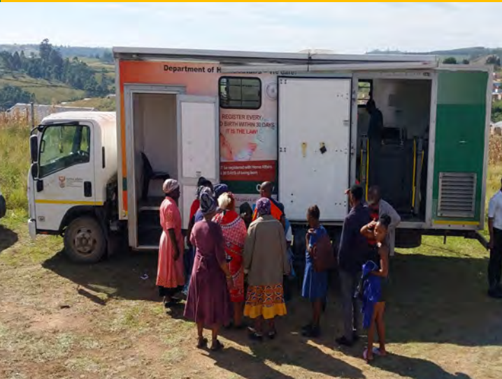
Home Affairs was also on site to render their services