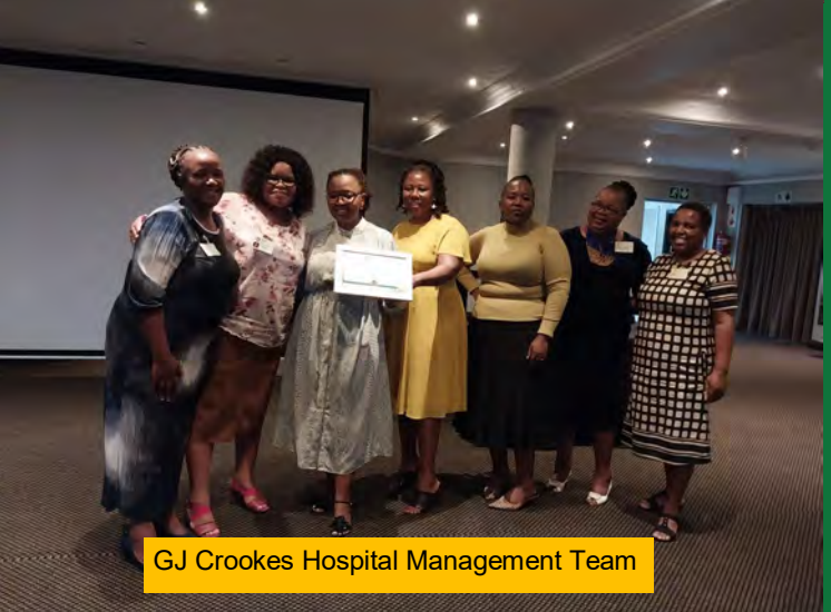
GJ Crookes Hospital Management Team

Ugu Health District recently conducted a safe Caesarean audits. These audits were conducted to all four hospitals under Ugu District and they all achieved the status. Its a National Saving Mothers Recommendations that Ugu District endorses, aimed at ensuring safe maternal outcomes. In a previous period nationally maternal mortality following bleeding at caesarean section was alarming, so this strategy was formulated.