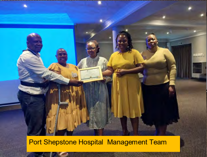
Port Shepstone Hospital Management Team