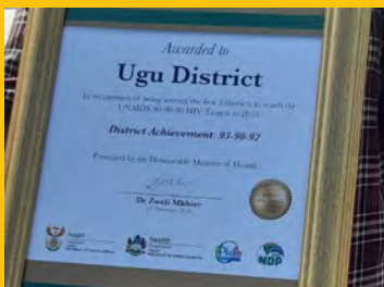
Ugu District achieved 90-90-90 target