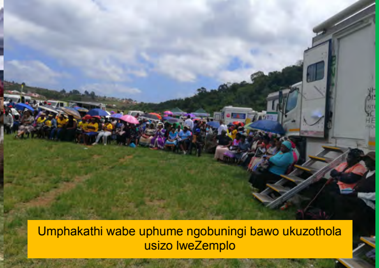
Umpakathi wabe uphume ngobuningi bawo ukuzothola usizo lweZemplo