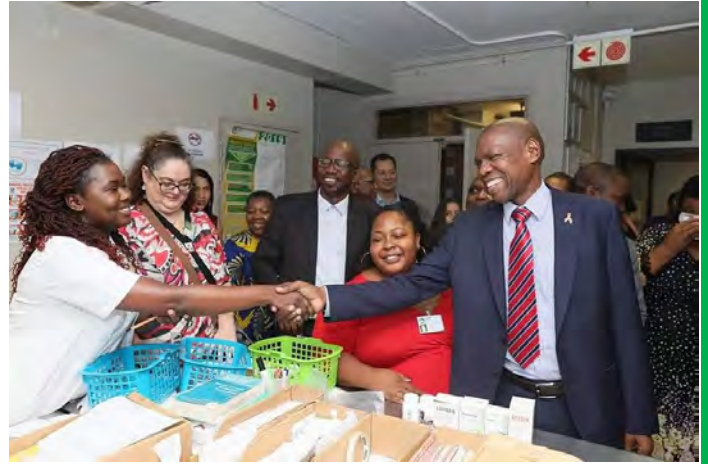
The National Minister Dr Zweli Mkhize at Pharmacy Department during walk about at Turton CHC