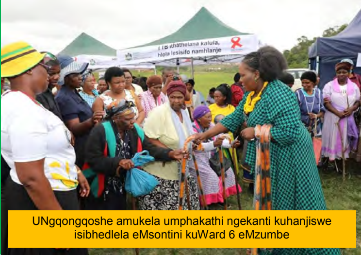
UNgqongqoshe amukela umphakathi ngekanti kuhanjiswa isibhedlela eMsonini kuWard 6 eMzumbe