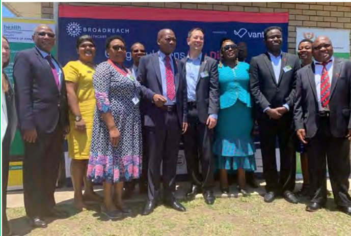
Minister and the MEC with BroadReach Management and Dept of Health Management congratulating Ugu District for reaching 90-90-90 target before 2020