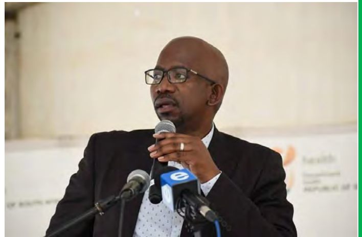
KZN Department of Health Head: Health directing the program at Esibanini Sport Ground at Umzumbe Municipality during the event