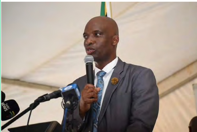
Ugu District Municipality Mayor Cllr Sizwe Ngcobo delivering his welcoming speech at Umzumbe Municipality during LTD launch