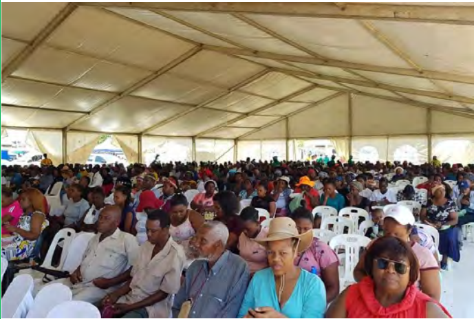
Ugu District Community members and Government officials, during TLD drug launch in Umzumbe Municipality