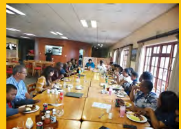
Year end function for 2019