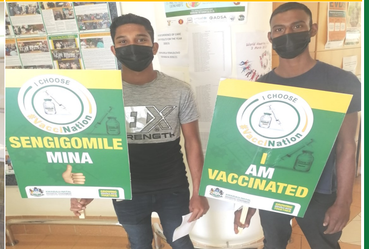
Akuthakasele kakhulu ama 2000 ukuthatha umgomo we Covid-19 eSibhedlela I GJ Crookes