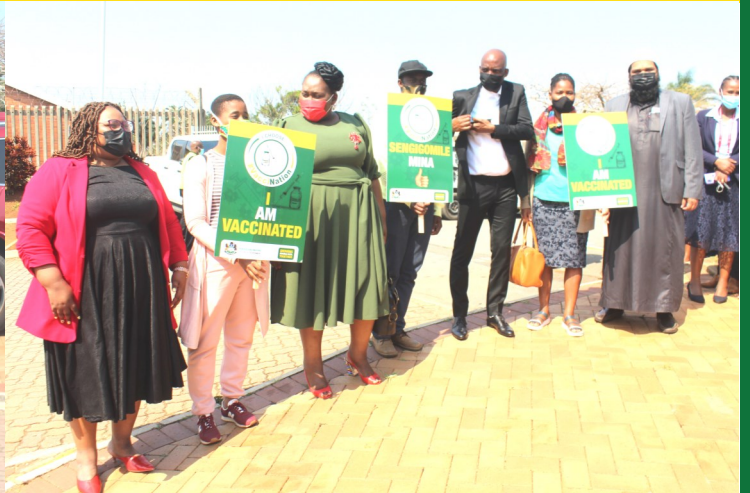
Ubuholi beisiFunda noNqongqoshe behalalisela ama 2000 emva kokuthatha umgomo we Covid-19