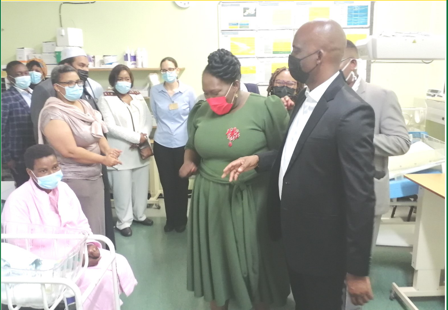
MEC FOR HEALTH MS NOMAGUGU SIMELANE AND UGU DISTRICT MAYOR CLLR SIZWE NGCOBO WELCOMING TRIPLETS

Impoverished mother of newborn triplets from KwaDumisa village, under Umdoni Municipality has found hope after a visit by KwaZulu-Natal Health MEC Ms Nomagugu Simelane. The triplets were born at GJ Crookes Hospital and they were recovering during the visit as they were one week old having been born prematurely, at eight months.