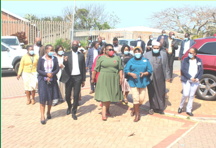
Ubuholi besiFunda kanye nabaphathi boMnyango behlangabeza uNqongqoshe