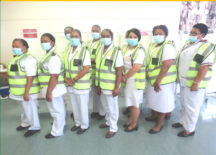
ABASEBENZI BEZEMPILO BENZA UMSEBENZI ONCOMEKAYO KULESI SIKHATHI SOKUGOMELA I COVID-19

Ephetha uthe zonke izikhungo zimi ngomumo abantu mabaphume ngobunigi babo ukuze kuvikeleke ikakhulu abantu abadala abakhombise isasa elikhulu.