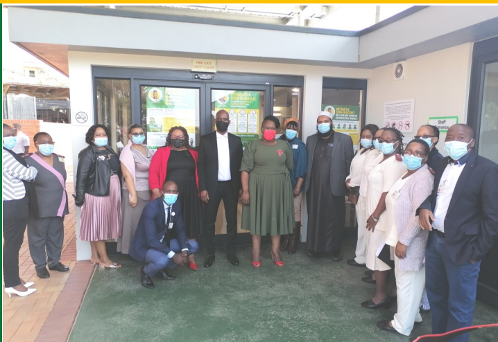
Igumbi lokulaphela iziguli ezihaqwe igciwane I Covid-19 elivulwe ngokusemthethweni eSibhedlela GJ Crookes