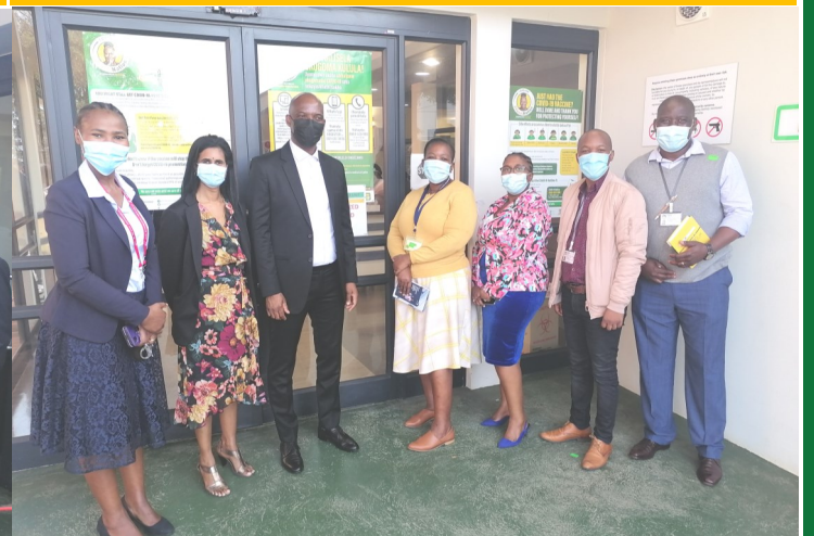
Igumbi lokulaphela iziguli ezihaqwe igciwane le Covid-19 elivulwe ngokusemthethweni eSibhedlela GJ Crookes