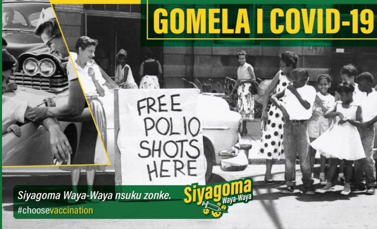
Siyagoma Waya-Waya nsuku zonke. Siyagoma Waya-Waya #choosevaccination