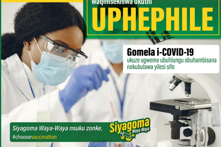
Gomela i-COVID-19 ukuze ugweme ubuhlungu obuhambisana nokubulawa yilesi sifo