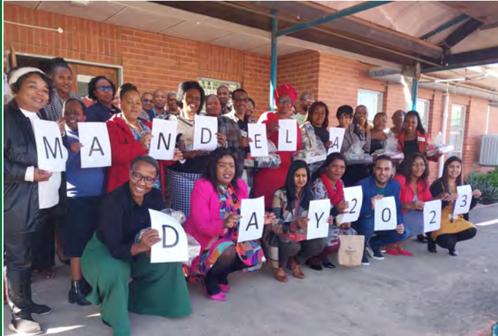
67 minutes of Mandela day