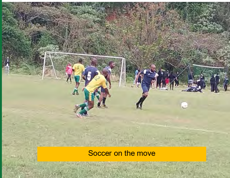
Soccer on the move