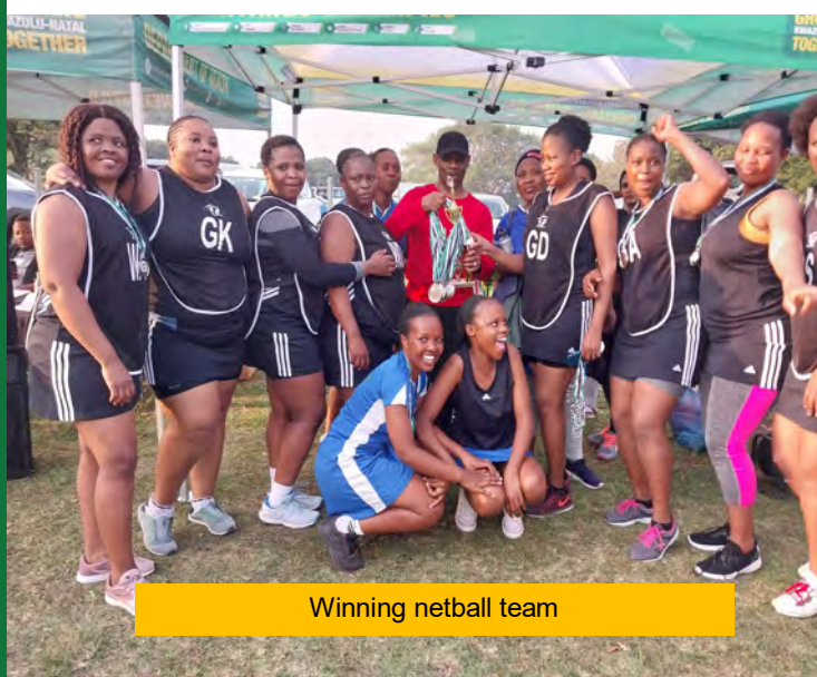
Winning netball team