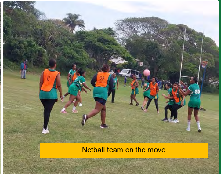
Netball team on the move