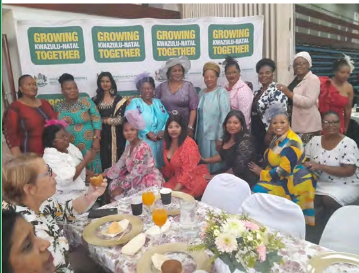
Abasebenzi beZempilo emcimbinini wabo e Uvongo