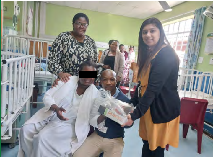
Mothers were happy to receive the gifts