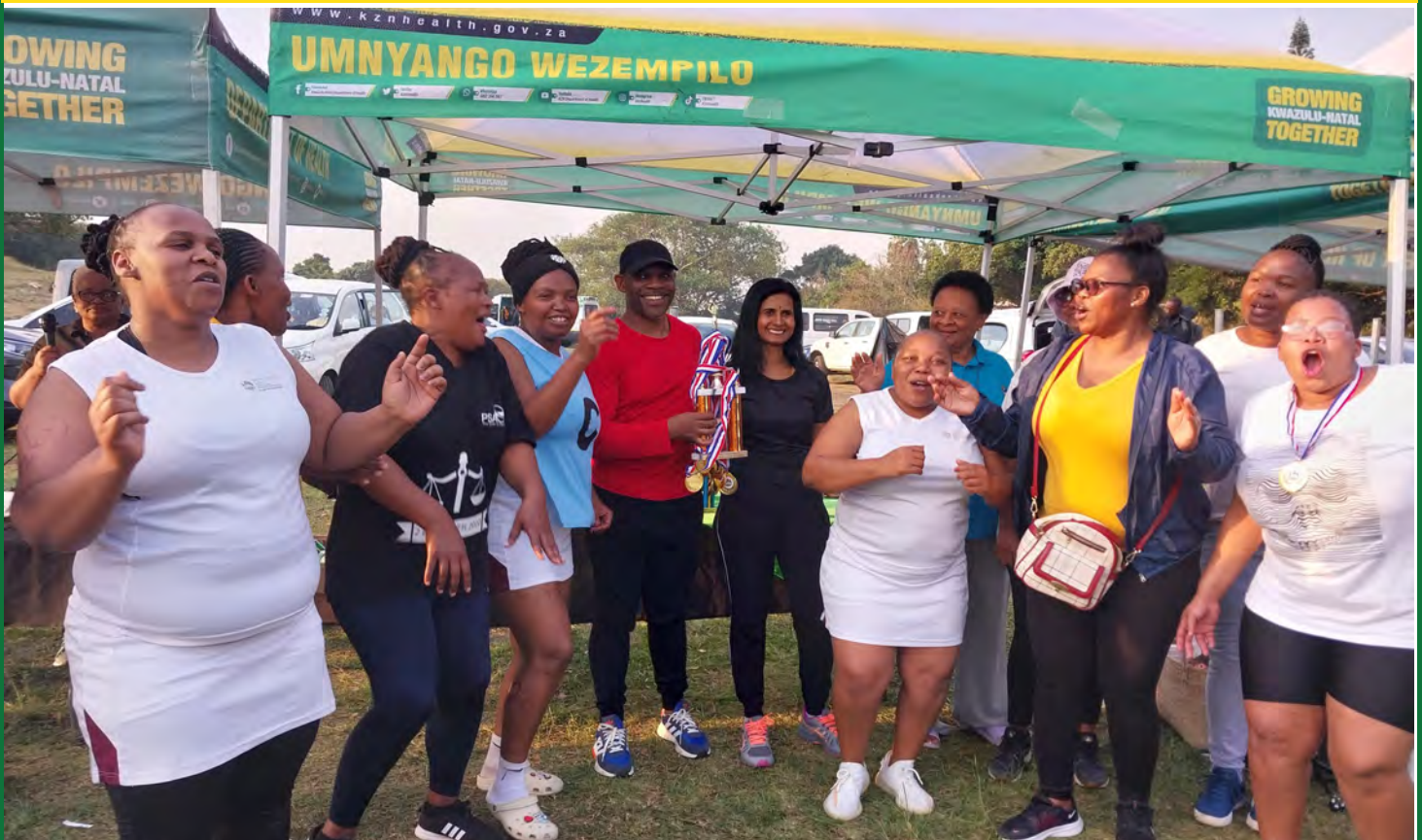
A successful wellness and sport day for Ugu Health District employees

Ugu Health District successfully hosted sports, wellness, work and play health promotion for all health facilities in the district. This event was on the 25th of August 2023 at Scottsburg Country Club, where all categories of employees gathered together for different sports codes which includes: Soccer, Netball, Tag Of War, Umlabalaba, Volley Ball, Pool, Egg And Spoon Race, Sack Race, 10KM Race, etc.