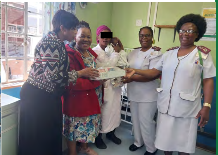
Ward Operational Manager was also happy for her children

Each individual has the power to transform the world and can make an impact in their own way. The call to dedicate 67 minutes to helping others symbolises the 67 years Nelson Mandela devoted to South Africa's political struggle, representing a lifetime of service. He has given 67 years of his life fighting for the rights of humanity. On the 18th of July every year people are encourage to spend time helping others.