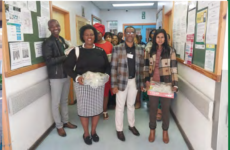
Gifts for Murchison children from ugu Management