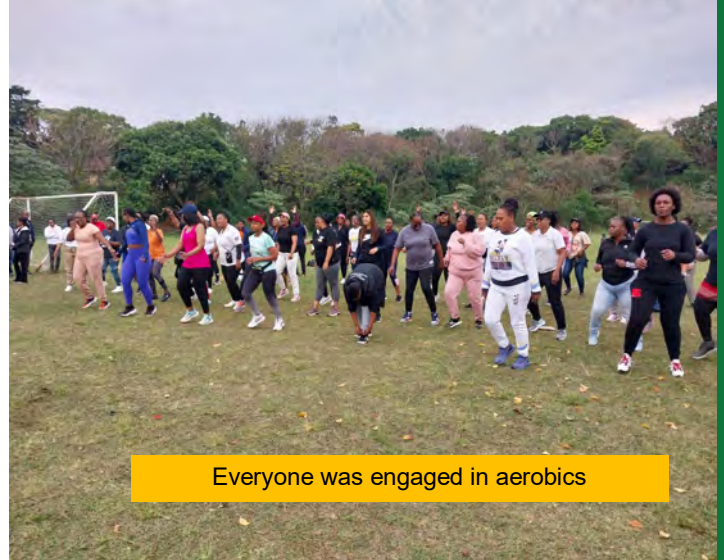
Everyone was engaged in aerobics