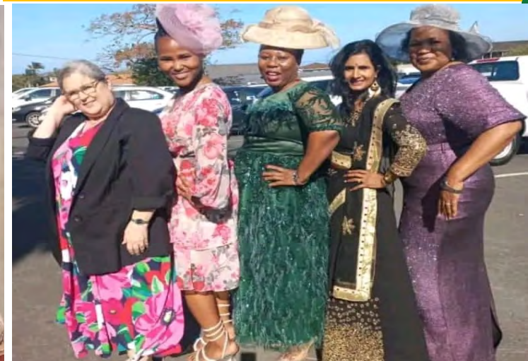
Abaphathi siFunda bebhkhiphe eyokugcina inqephu kulomcimbi wabesifazane bomnyango obusehholo I Uvongo