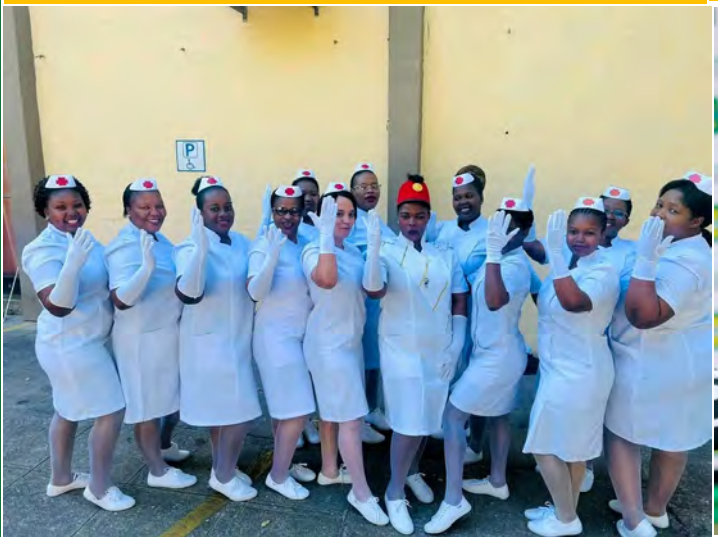
Abahlengikazi besibhedlela I Port Shepstone abahlangabeze uNgqongqoshe ngesizotha ezothamela umcimbi