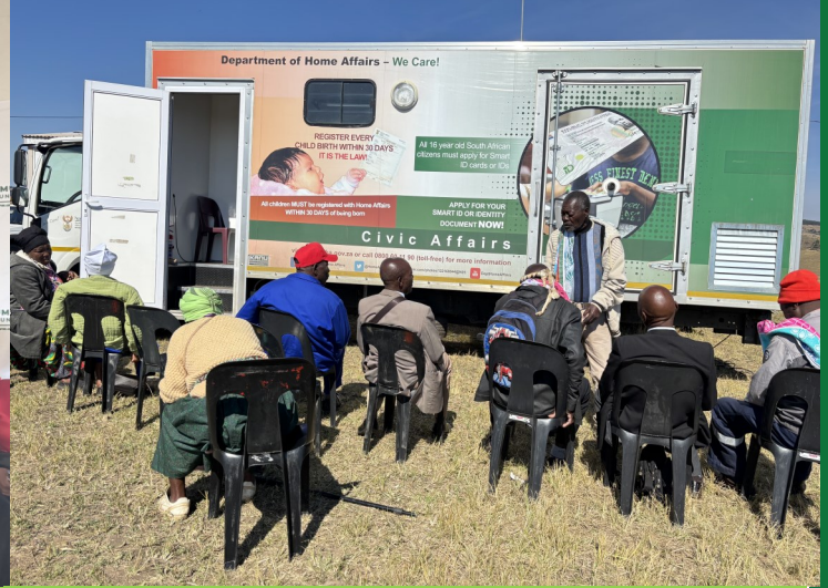
Iminyango KaHulumeni ilethe izinsiza emphakathini

UMnyango weZempilo wethule ngokusemthethweni Ixhiba Labafazi endaweni yakwaFodo e Santombe ngaphansi kwenkosi u Dlamini. Inhloso yeXhiba Labafazi ukuhlenganisa abantu besifazane ezindaweni zamakhosi ngokuzama ukusabalalisa ulwazi ngokwezempilo kanjalo nokugqugquzela ukwakhana ngezihloko ezihlukahlukene ikakhulukazi ngezinto ezithinta abantu besifazane.