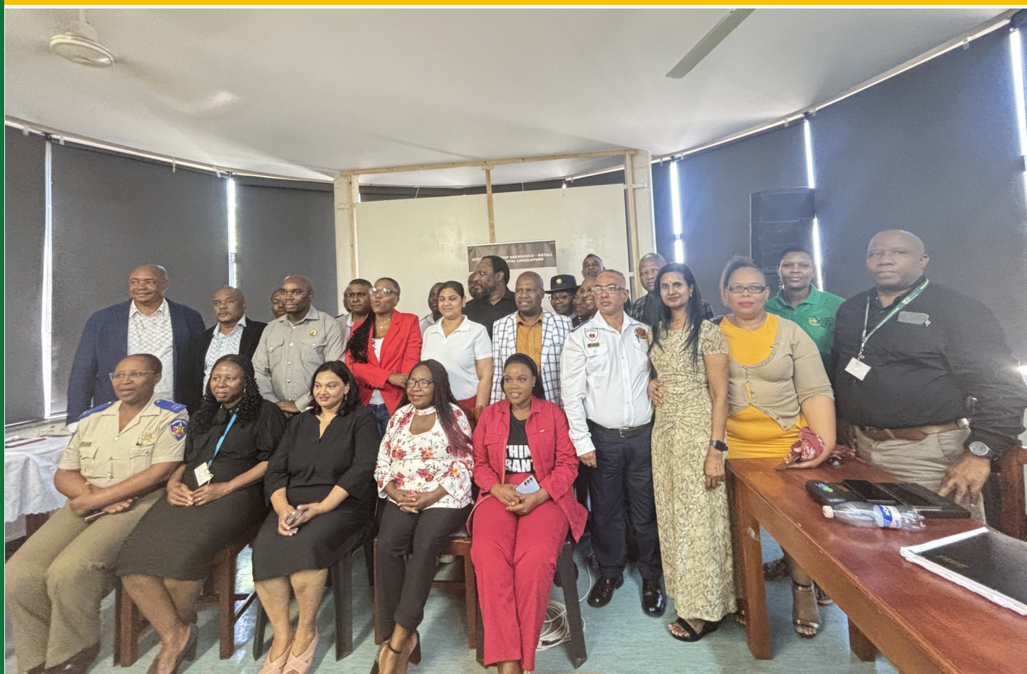
KZN Legislature members and Ugu Health District Management during the oversight visit

A delegation from the KwaZulu Natal I Health Portfolio Committee conducted an oversight visit to Ugu Health District Emergency Medical Services. The aim was to assess the state of emergency response operations, evaluate resource utilization, and ensure accountability. The oversight visit was part of the legislature's constitutional mandate to monitor the performance and effectiveness of government.