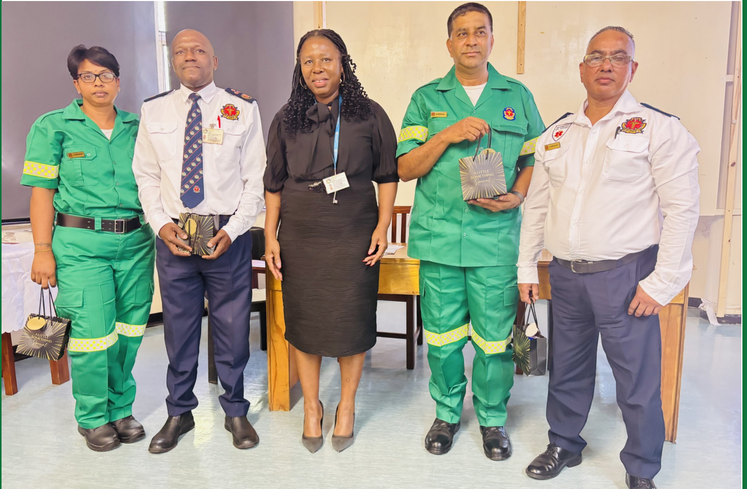
Ugu Health District Director and EMS Management during Legislature Members oversight visit