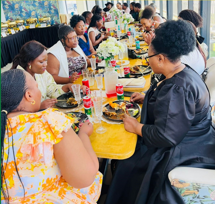
Ugu Health District women during women's day function

The theme for 2025 women's day was "Building Resilient Economies for All" . Ugu Health District women took an opportunity to celebrate this day in style. Lunch was organised for them and they had a chance to capacitate each other while enjoying themselves.