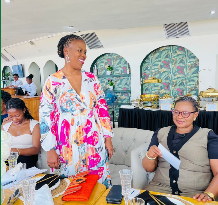
Ugu Health District Women's Forum Chairperson