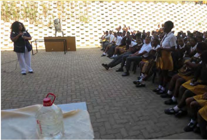
One of the nurses educating learners at Malusi