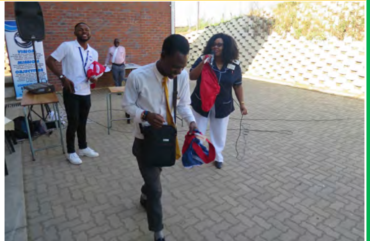
Awareness day event at Malusi High School