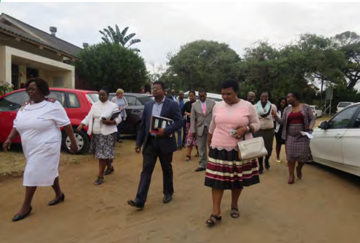
Walk about at Umtentweni Clinic