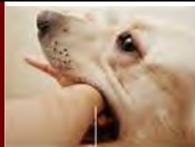
Virus transmitted by infected saliva through bite or wound