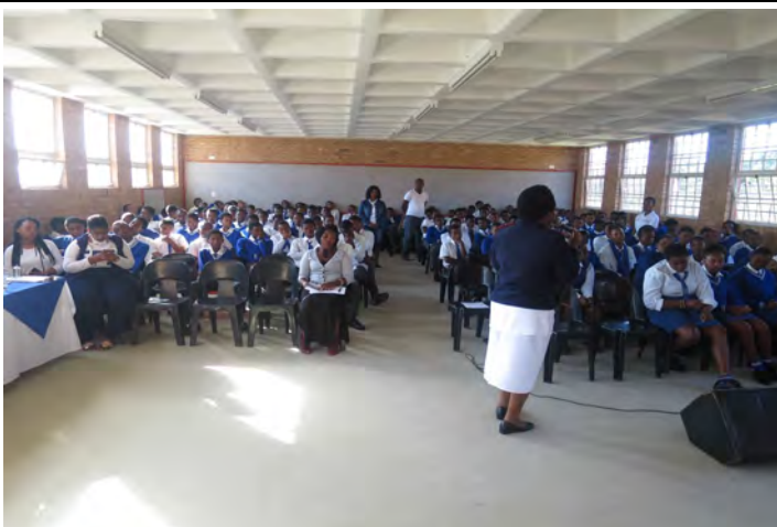
One of the nurses learners at George Mbhele High