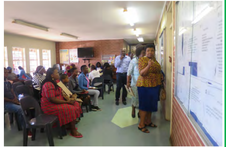
Walk about at Assis Clinic

Ugu Health District had a Legislature visit which was targeting three Clinics. The visit started at Morrison's Clinic on the 19 th of June and proceeded to Assis Clinic on the same day, it then ended at Umtentweni clinic on the 20 th of June. The briefing for the District Management was at the District office after walk about in Umtentweni Clinic.