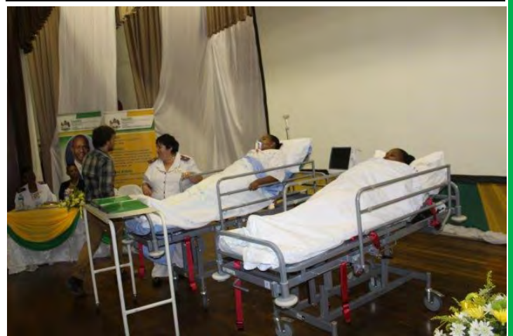
Role play by health workers

On the 19th of April 2018 Ugu Health District had an Ethics Seminar at the Civic Centre, Connor street in Port Shepstone. The purpose of the seminar was to Revive work ethics to all Ugu Health workers. The objectives of the ethic seminar was to improve work ethics, rekindle professionalism, motivate and encourage the staff, and lastly to improve communication between health professionals and patients.