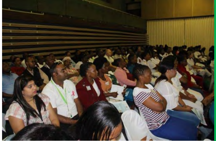
Health workers during Ethics Seminar