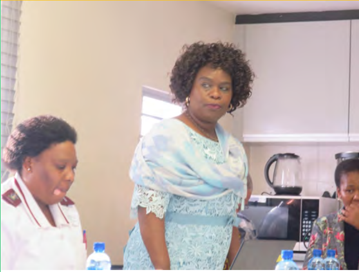
Hon. N Majola introducing member of legislature on the first day of the visit.