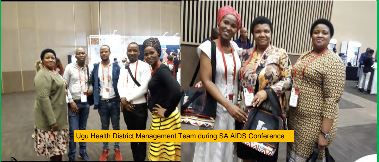
Ugu Health District Management Team during SA AIDS Conference