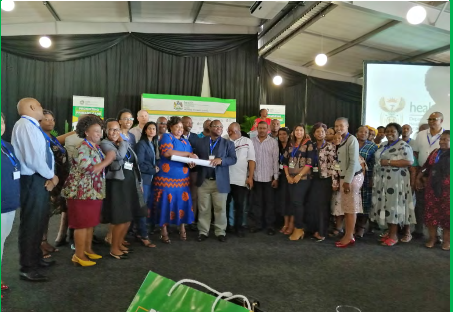
Ugu Health District Team attended the first KZN PHC Conference at Greyville Race Course in Durban