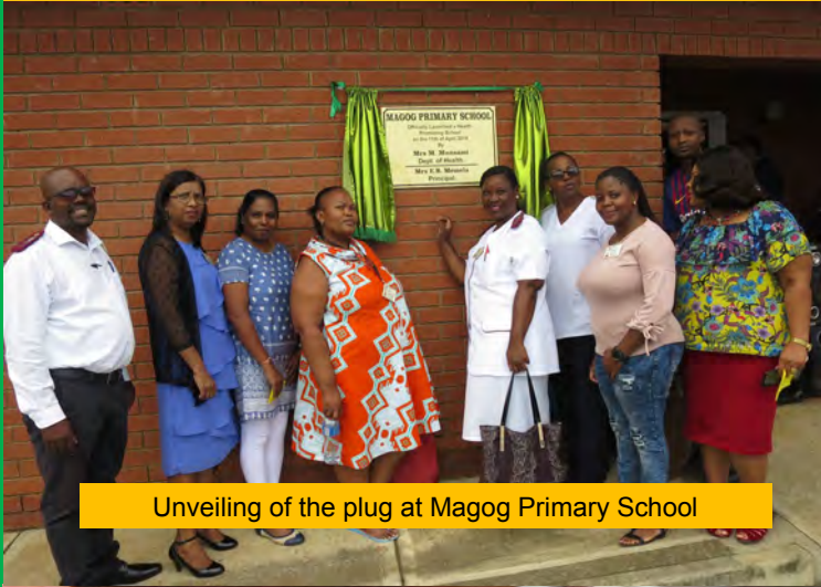
Unveiling of the plug at Magog Primary School