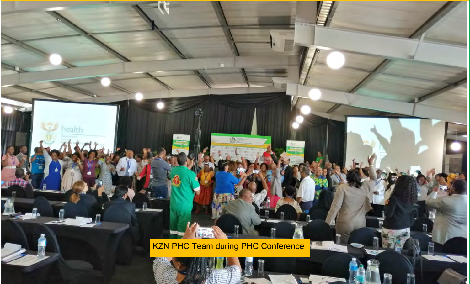
KZN PHC Team during PHC Conference