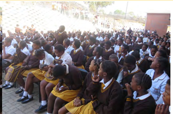
School children She Conquers youth dialogue