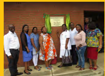
Another promoting school in Ugu

FIGHTING DISEASE, FIGHTING POVERTY, GIVING HOPE