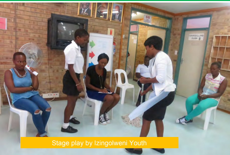
Stage play by Izingolweni Youth

In commemoration of youth month Ugu Health District and Murchison Hospital launched Adolescence Youth Friendly Services at Izingolweni Clinic on the 28th of June 2019. The event started by a healthy lifestyle session which was led by youth from Izingolweni community.