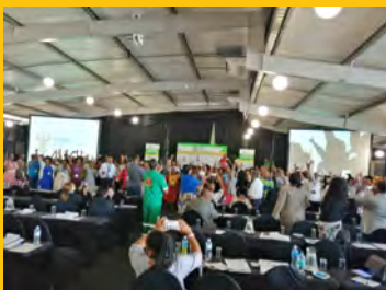
KZN PHC Conference