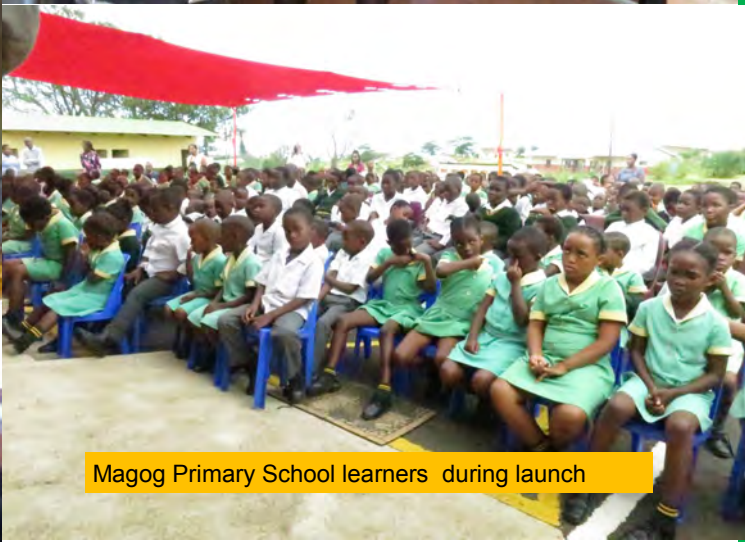
Magog Primary School learners during launch

Ugu Health District is pleased to see the number of Health promoting schools increasing in the district. This follows the launch of Magog Primary School as a health promoting school which was on the 11th of April 2019. 29 schools has been launched as health promoting schools in Ugu District since the programme has started.