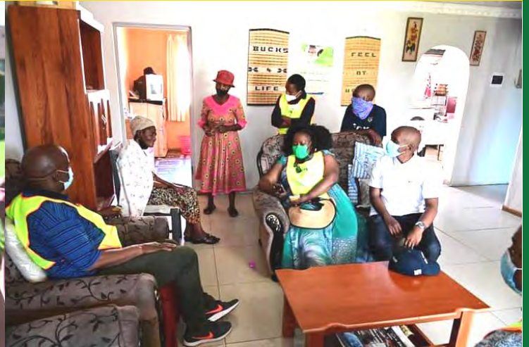
Abaholi bathathe umgomo we Covid-19 bawungenisa ezindlini kanti kuhlomule nabadala kuloluhlelo.