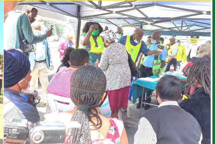
Baxoxisane nomphakathi abaholi ngomkhankaso wokugoma kwisiFunda uGu.