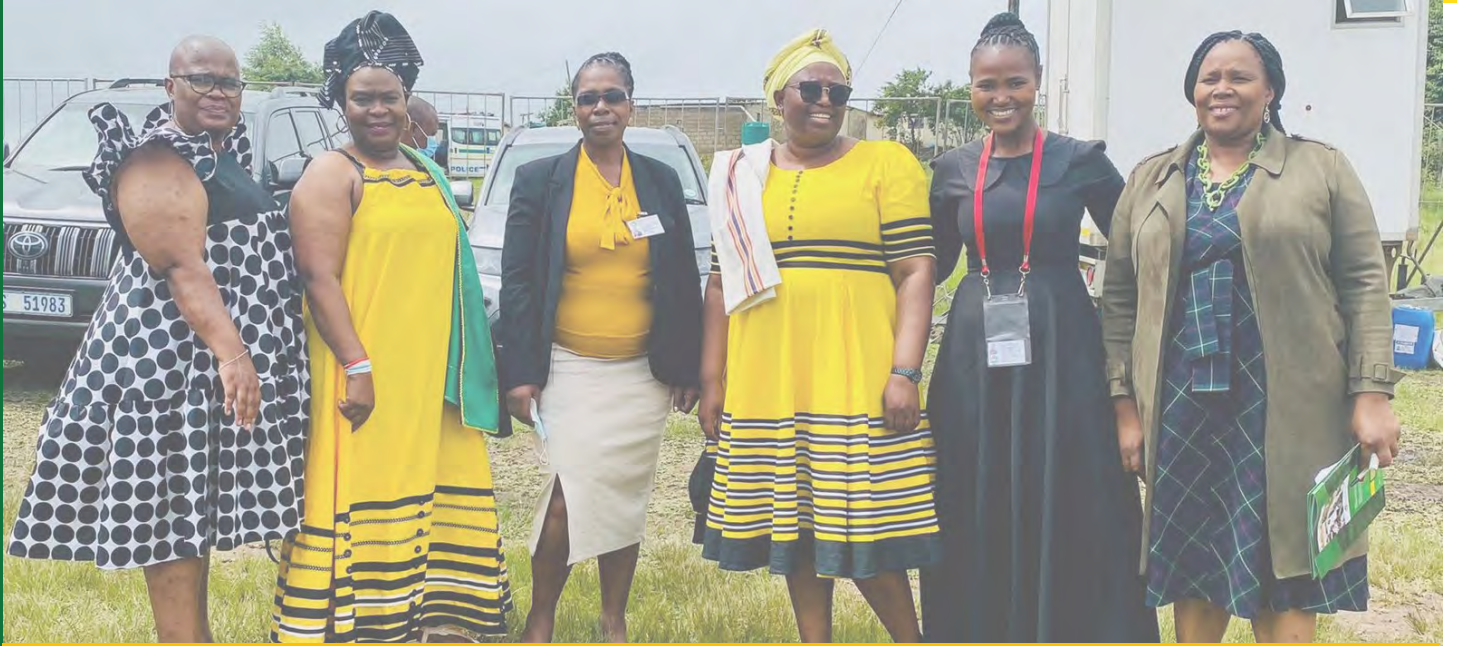
UGu Health District Management team during World AIDS Day in Umuziwabantu Municipality