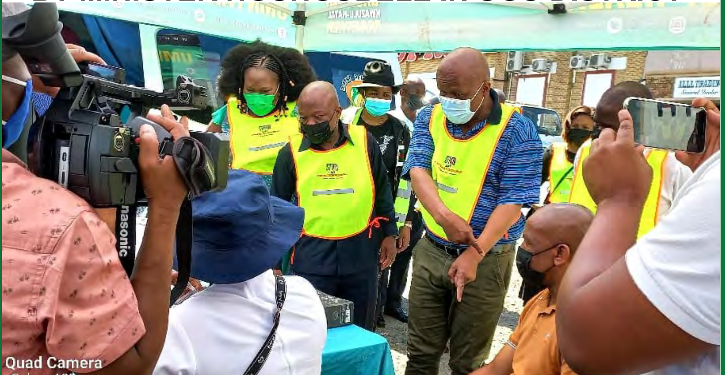
Quad Camera Canon 430