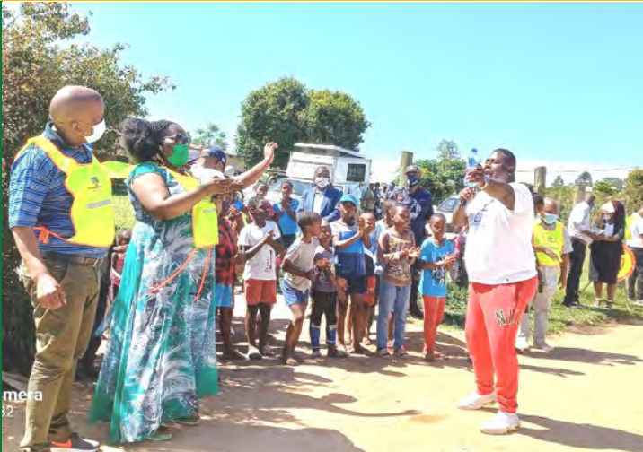
Kugcwale imigwaqo kwisiFunda uGu abaholi benxensa abantu ukuba bathathe umgomo we Covid-19.