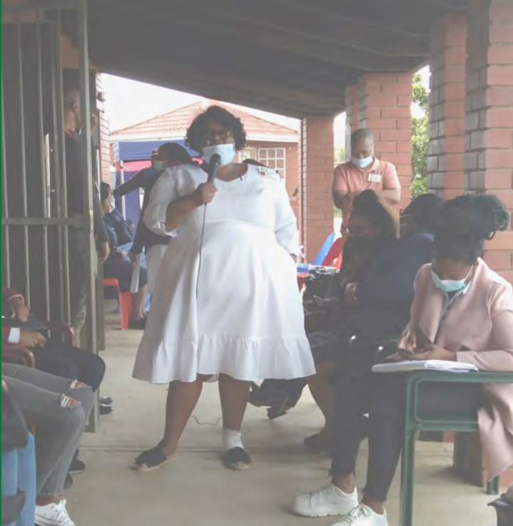
Umphathi woMtholampilo iPhilani ekhuluma nentsha yaseMandaweni KwaCele ngokuziphatha.