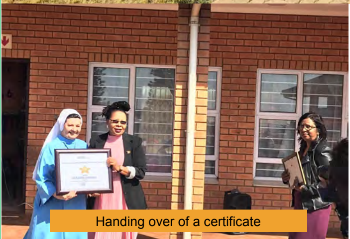
Handing over of a certificate

Ugu Health District launched John Paul Early Childhood Development Centre as the first health promoting center in the District. John Paul is the fourth ECDC to be launched throughout the province.