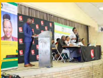
MEC visit at Umdoni Municipality