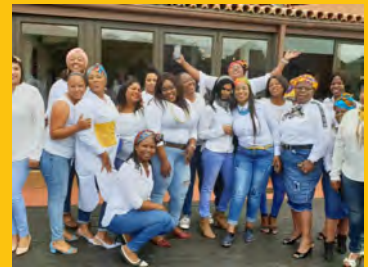
Happy women's month ladies

FIGHTING DISEASE, FIGHTING POVERTY, GIVING HOPE