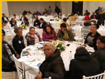
DPSA Deputy Minister Visit