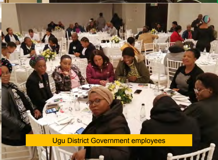
Ugu District Government employees

Public servants in Ugu District Municipality had an opportunity to engage with the Deputy Minister for the Public Service and Administration, Ms Sindisiwe Chikunga as part of the Integrated Government Wide-Public Service Month on the 6th of September 2019. The visit formed part of the month long celebratory and service delivery focused programme by various government departments that was being rolled out across the country in all three spheres of government from 1 September to 04 October under the theme: "Khawuleza: taking public service to the people: we belong, we care, we serve."