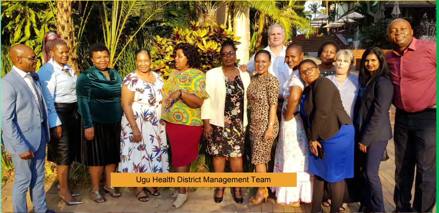
Ugu Health District Management Team