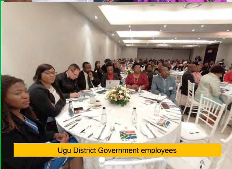
Ugu District Government employees