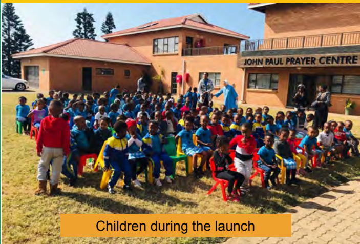
Children during the launch