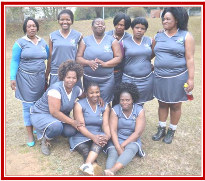
Howick Municipality Netball Team