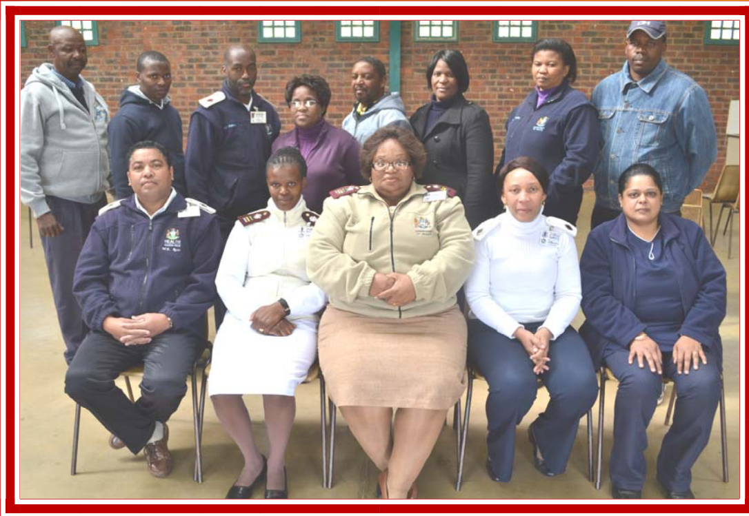
Umgeni Hospital Team that worked hard to put patients first !!!!