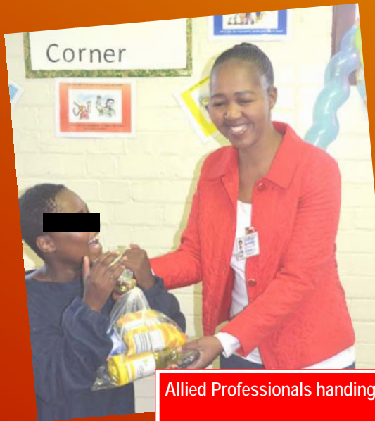
Allied Professionals handing packets of snacks to MHCU's