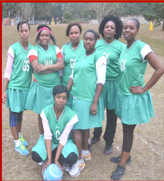
Umgeni Hospital Netball Team