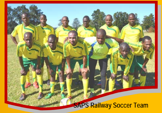
SAPS Railway Soccer Team