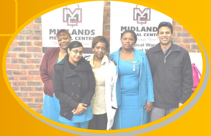
Nurses from Midlands Medical Centre with the Public Relations Officer