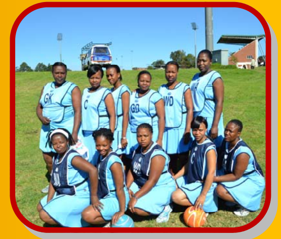
SAPS Howick Netball Team