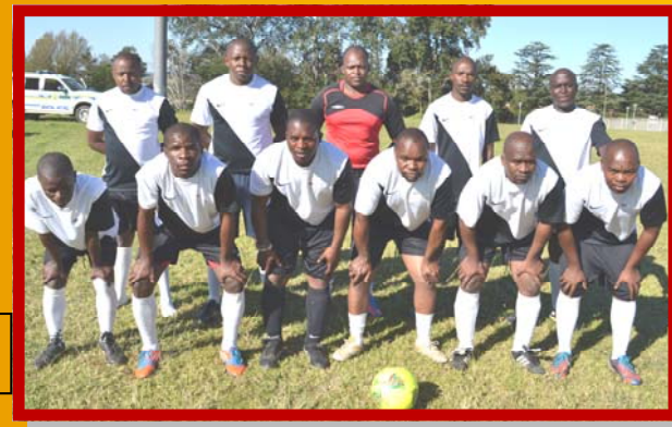
SAPS Howick Soccer Team