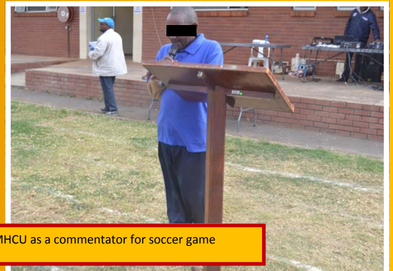
MHCU as a commentator for soccer game