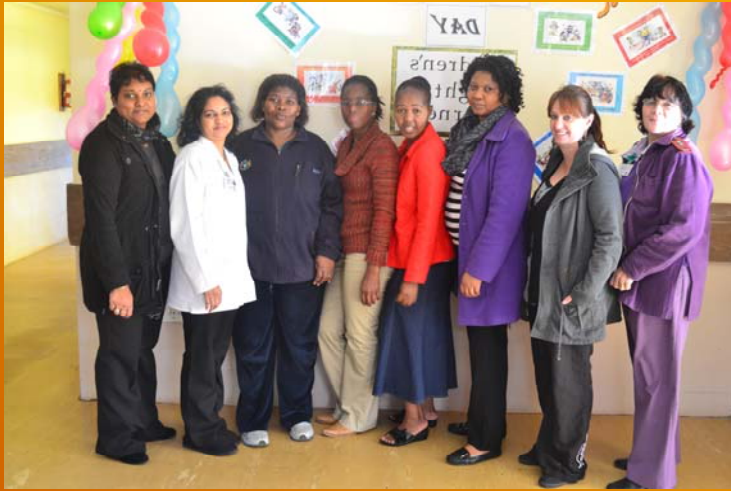
Allied Professionals and Operational Manager for Ward 2 (Childrens Ward)