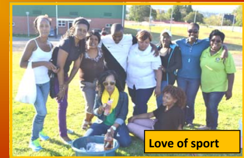
Love of sport