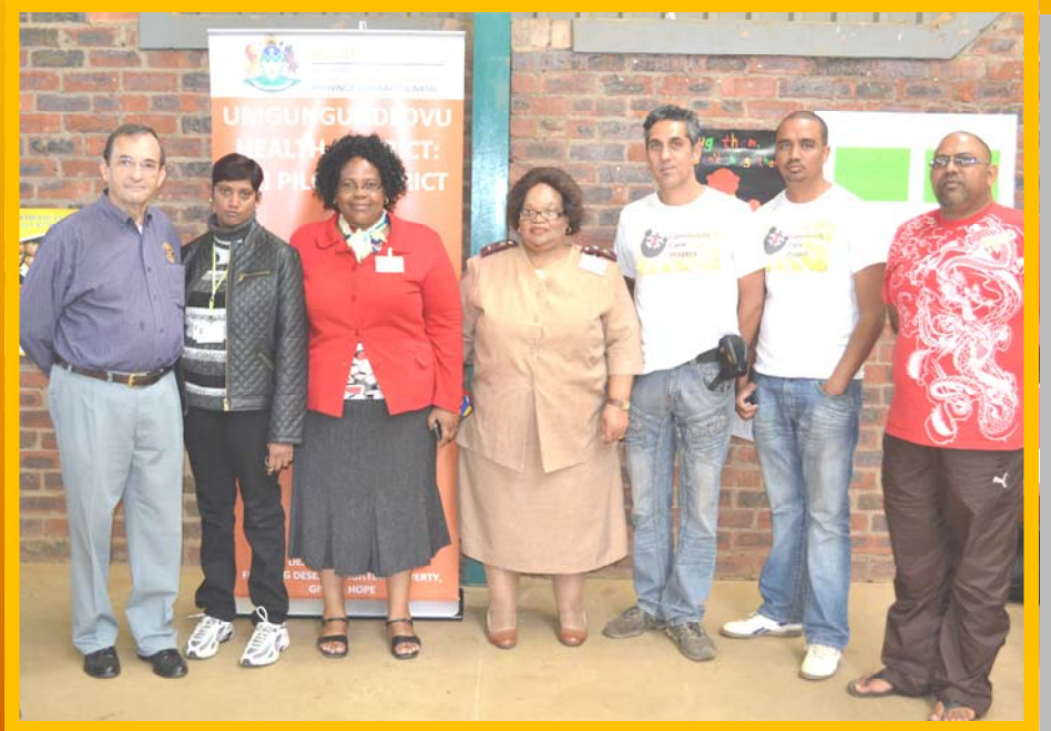
Rotary Club Members with representatives from the Department of Health

On the 10 May 2013 and 11 May 2013 the turnover was poor due to the weather condition but the staff from the different hospitals and Rotary Club were committed to their call of duty i.e. bringing services to the people as it is stipulated in the Constitution of South Africa .