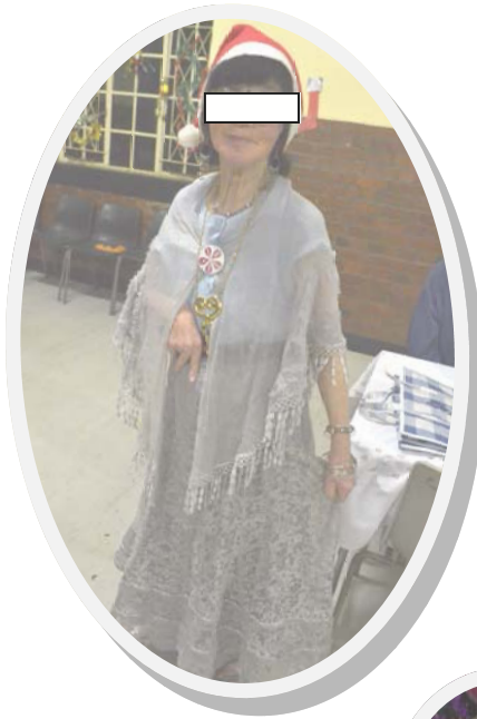
MHCU showing her outfit