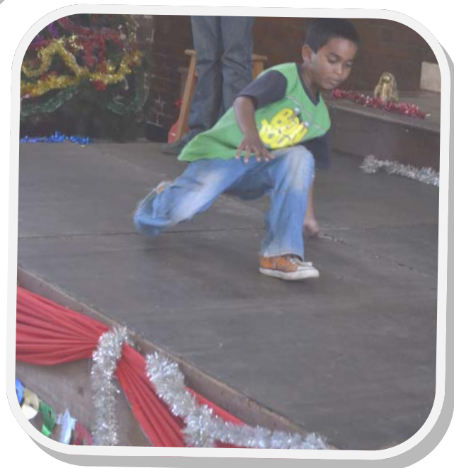
Child from the New Anointing Ministries International Church entertaining MHCU's