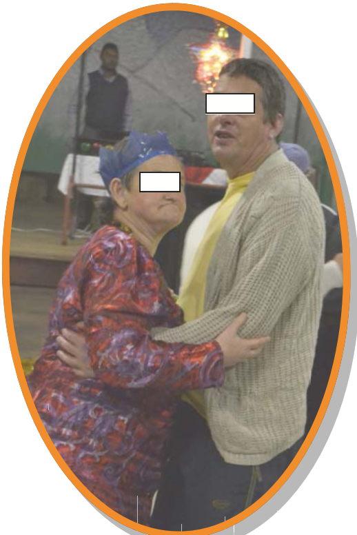
Christmas events for MHCU to enjoy and show their talent