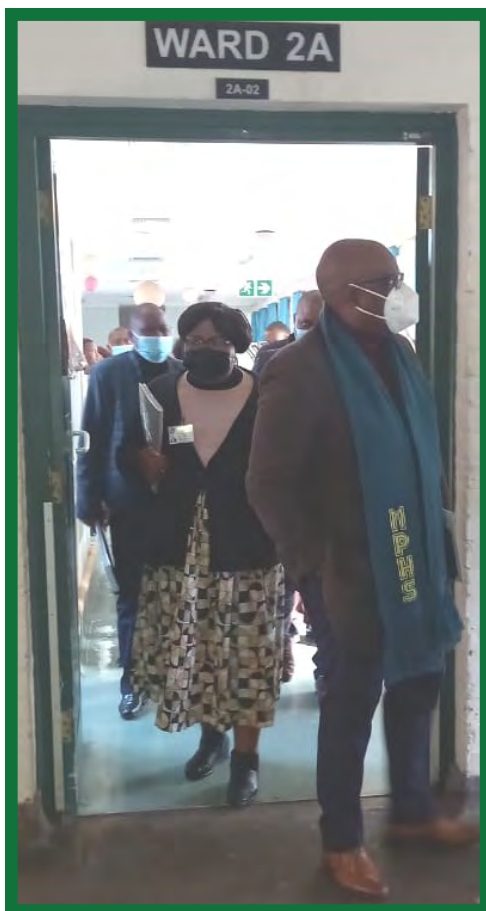
Ward 2 for Adolescence was visited

Nurses and staff of Umgeni Hospital were praised with their work which substantiated that the management leads with strategic directions in spite of challenges; like staff shortage and aging infrastructure.