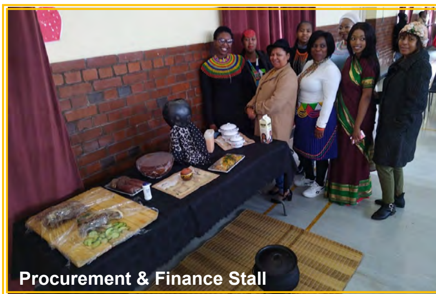
Procurement & Finance Stall