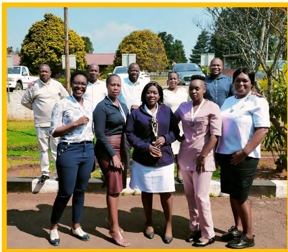
Back Row: Executive Management