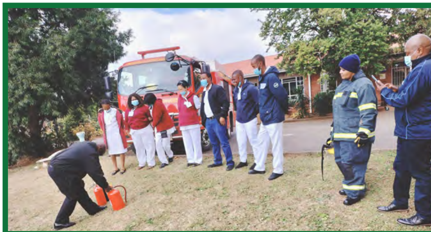
Fire Department personnel doing a demonstration on fire equipment and how to use it during the time of disaster