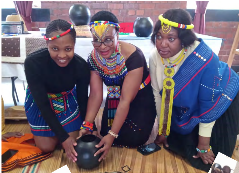
Heritage Day pictures

The event was a success with attendance, entertainment and observing togetherness among staff members. The happiness of staff showcasing their inheritance of heritage was at heart. The event would have not been a success without the dedication of Special Events Committee; continue to work as a team.