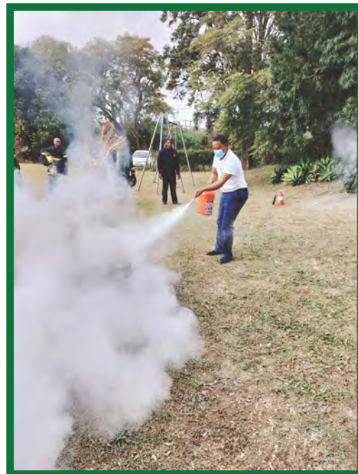
Staff member using fire extinguisher